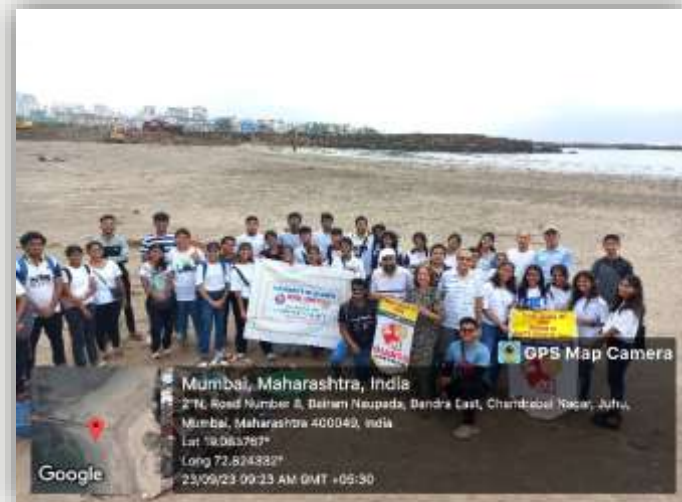
JHU BEACH CLEANUP