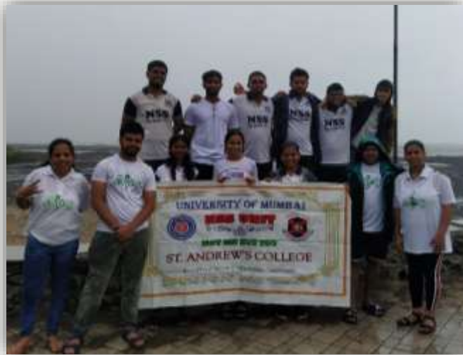
CARTER'S BEACH CLEANUP