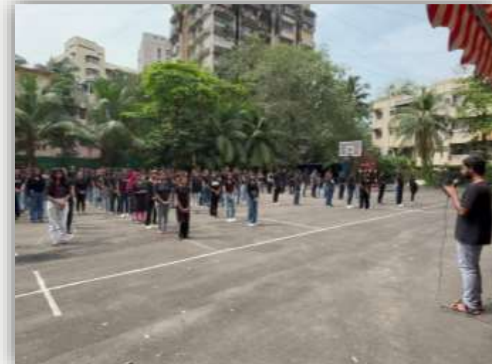
'SWACHATA HI SEVA' PLEDGE