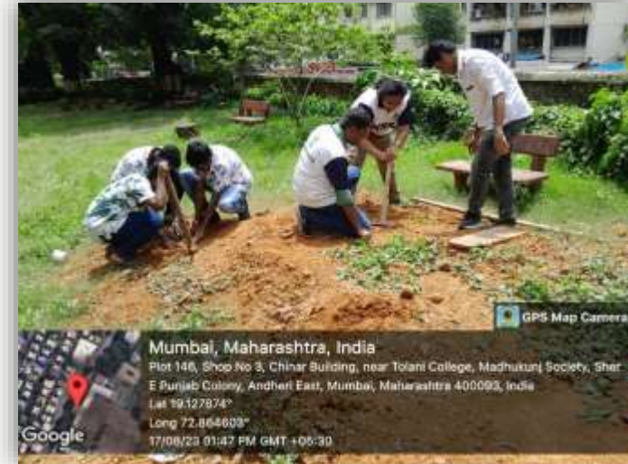
SAPLING PLANTATION UNDER 'MERI MATTI MERA DESH'