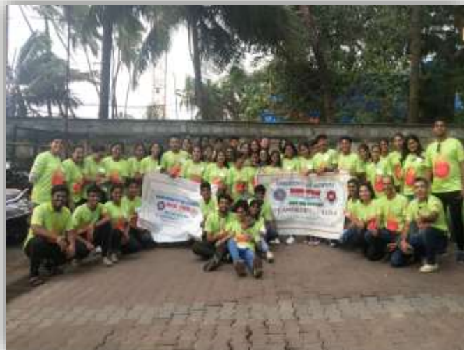
BLOOD DONATION DRIVE