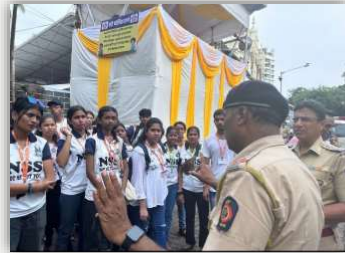
VOLUNTEERING AT MOUNT MARY, BANDRA FAIR