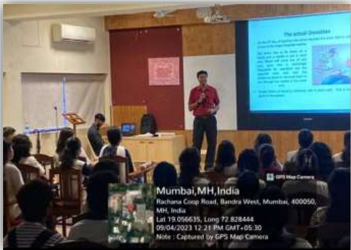
STEM CELL SEMINAR