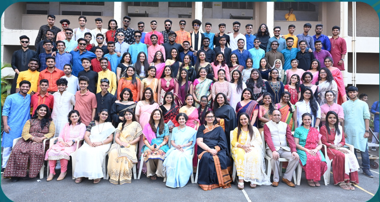
TY BCom - B