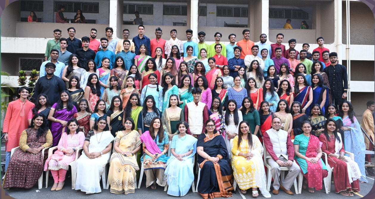
TY BCom - C