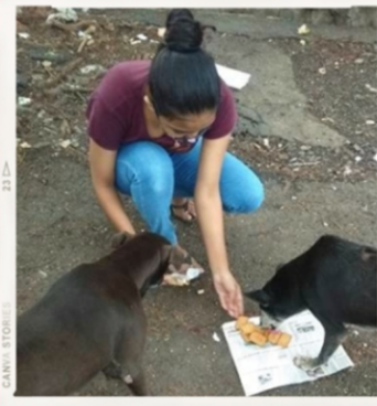
ANIMAL FEEDING ROTI GHAR