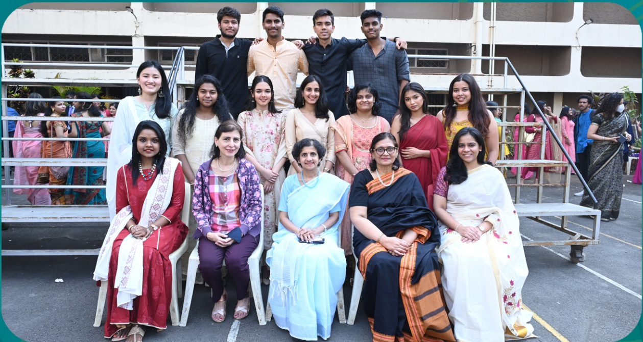
TY BA (Economics)