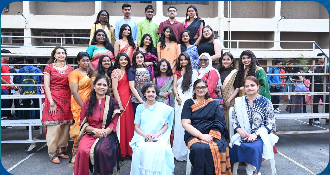
TY BA (Sociology)