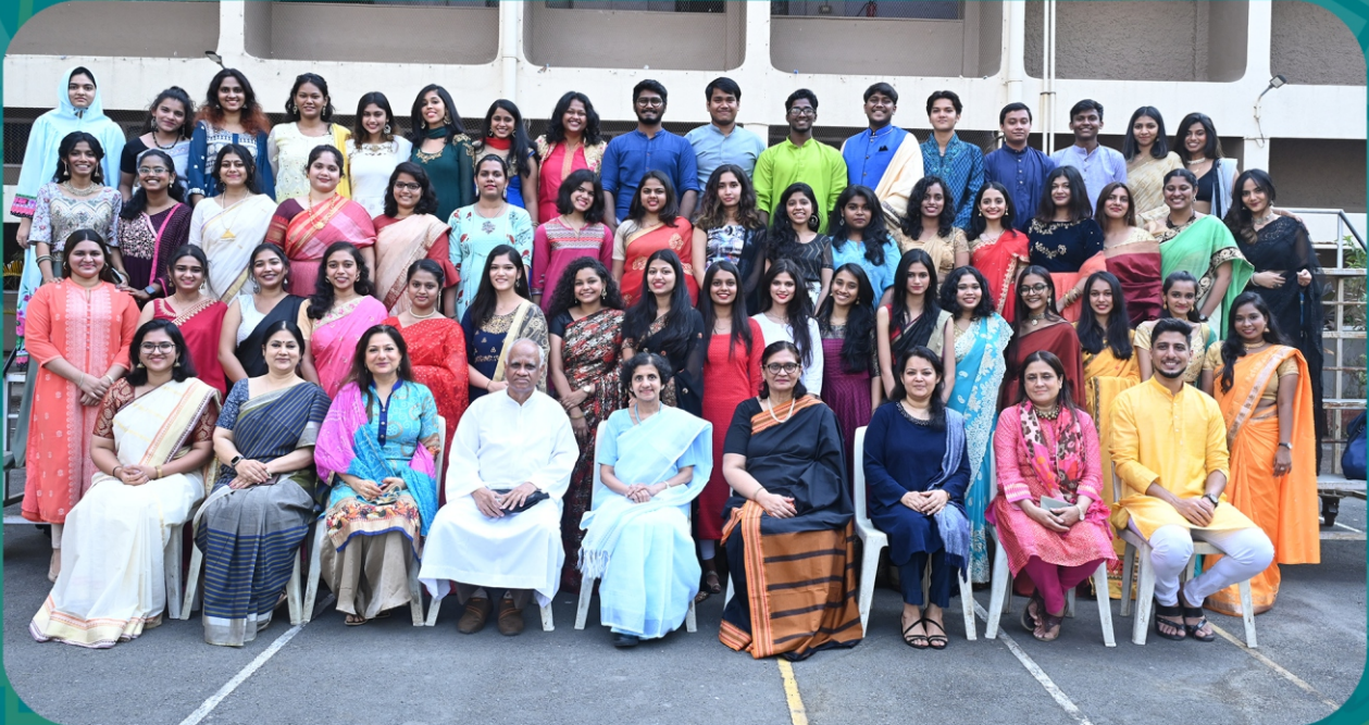
2022-23 ST. ANDREWS COLLEGE TY BA (English - Psychology)