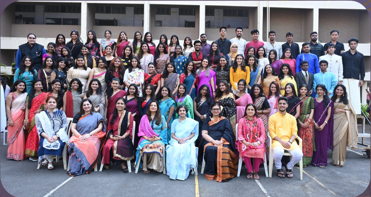
TY BA (Sociology, Sociology - Psychology & Sociology - History)