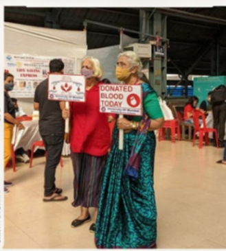
BLOOD DONATION JAGJIVAN RAM HOSPITAL