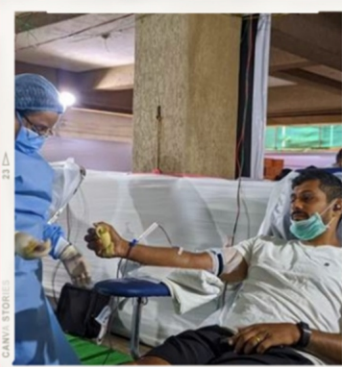
BLOOD DONATION TATA MEMORIAL