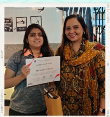
Prize Distribution of BIZZ-WHIZZ 2.0 QUIZ