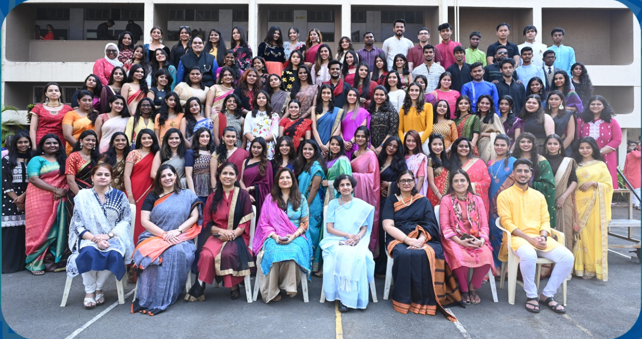
TY BA (Psychology - Sociology & Psychology - History)