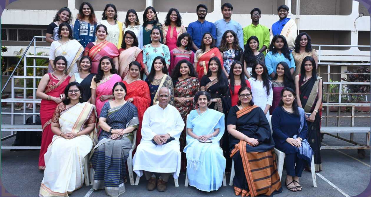
TY BA (English)