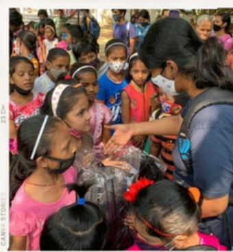
STATIONERY DONATION KHUSHIYAAN