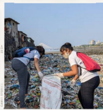
BEACH CLEANUP MAHIM