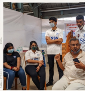
BLOOD DONATION NAIR HOSPITAL