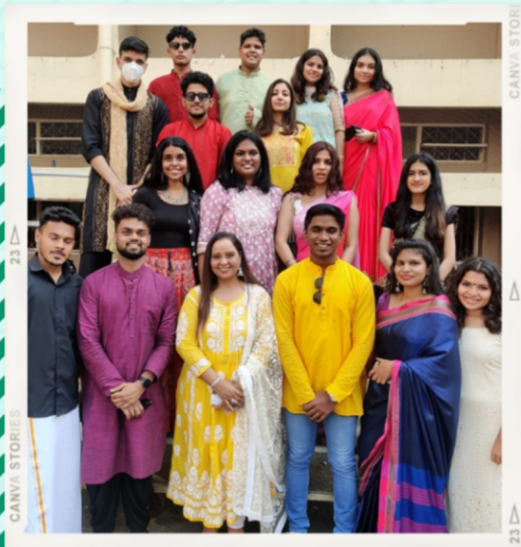
The Team 2021-22