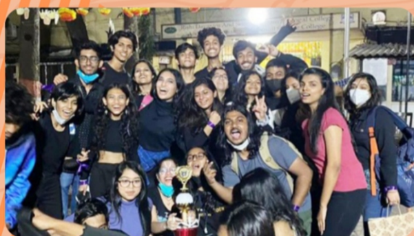
BAMMC Department : Students won the PR at BMM fest 'Cutting Chai'