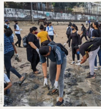
BEACH WARRIORS BEACH CLEANUP DADAR