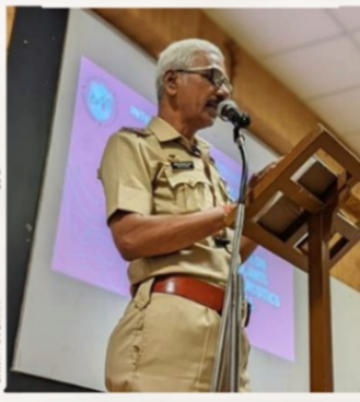
ATC NIRBHAYA SQUAD