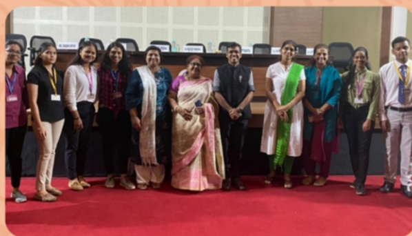
Accountancy Department : Visit to ICAI, BKC