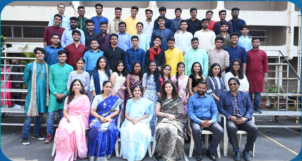
TY BSc (IT)