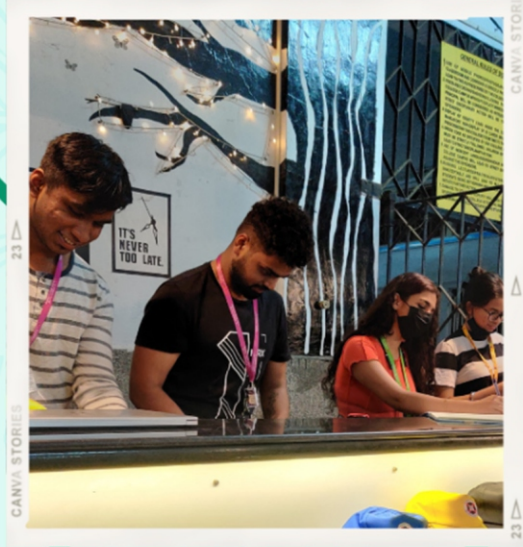
The Relaunch of MERCHANDISE