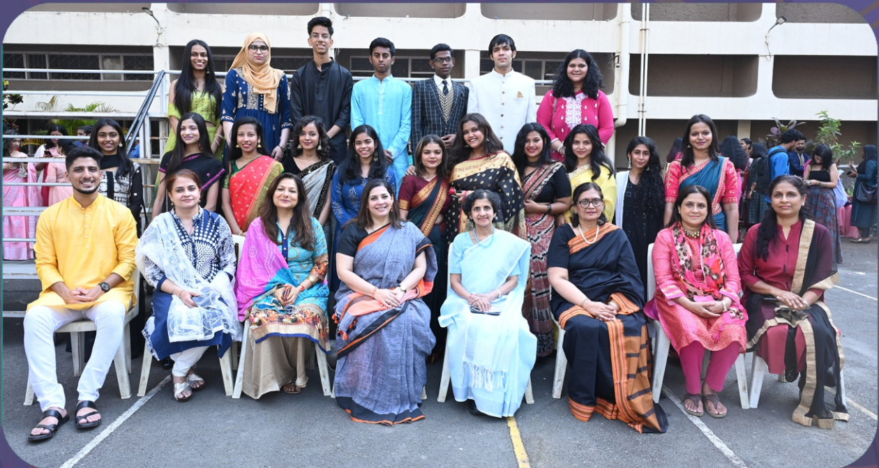
TY BA (History - Sociology & History - Psychology)