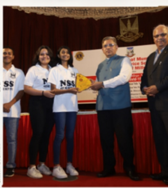
FELICITATION FOR BD THE VC OF UOM