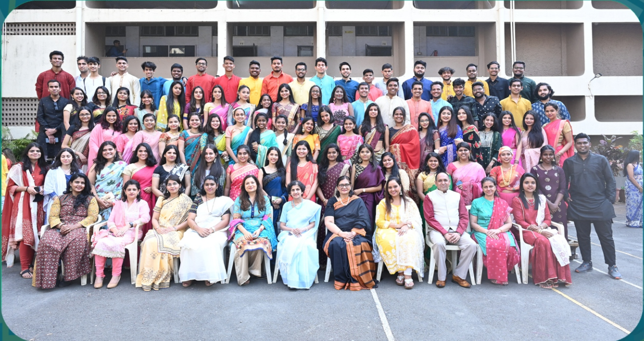
TY BCom - A