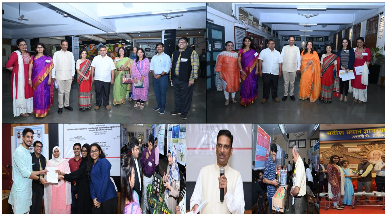
17 th Inter-collegiate/Institute/ Department Aavishkar Research Convention 2022-2023 Zone III