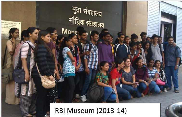
RBI Museum (2013-14)