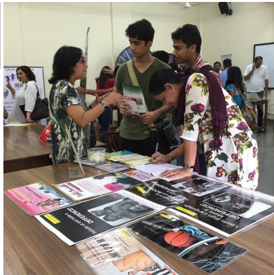
US Information Centre: Career Fair (2015-16)