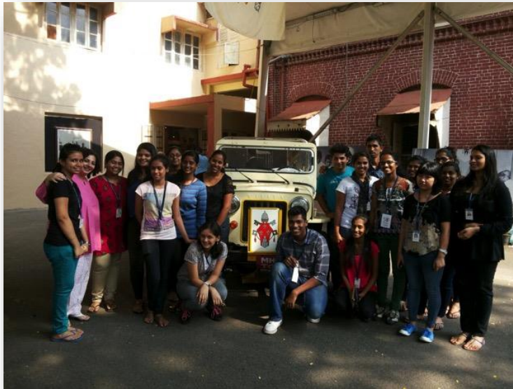
Eucharistic Congress 50 th Anniversary: St. Andrew's College History Volunteers.