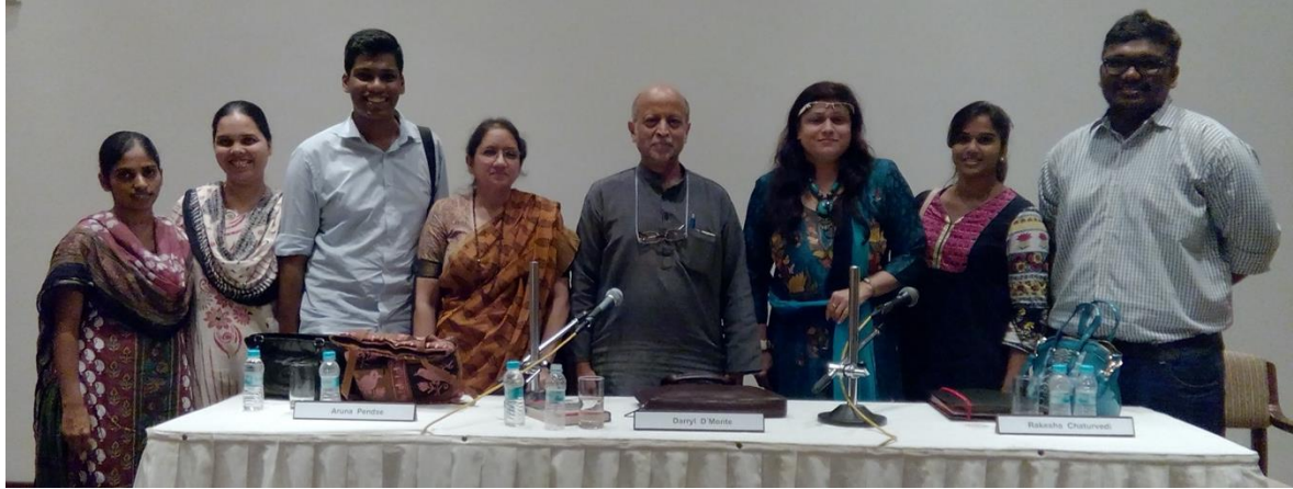
Nehru Centre, Worli: Book Discussion with TYBA Students on “Nehru’s India” (2015-16)