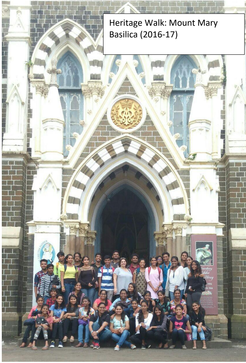
Heritage Walk: Mount Mary Basilica (2016-17)