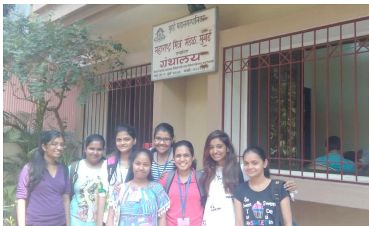
Maharashtra Mitre Mandal Library (2016-17)