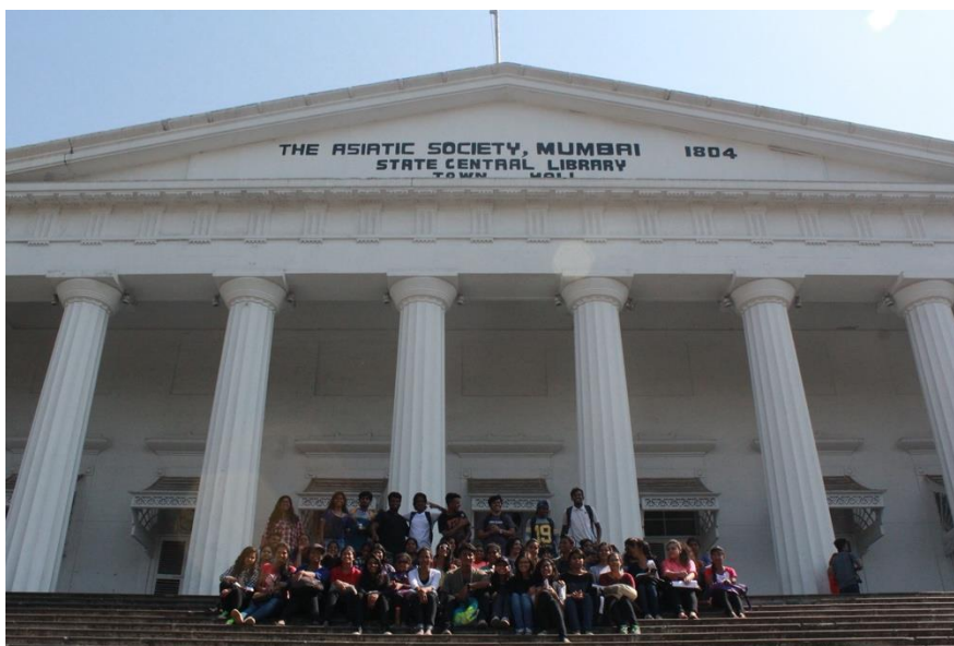
Asiatic Society of Mumbai (2016-17)