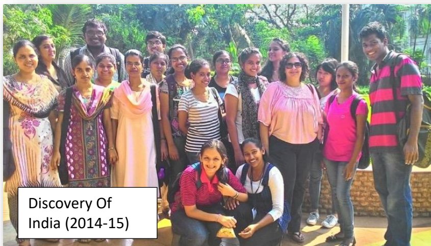
Discovery Of India (2014-15)