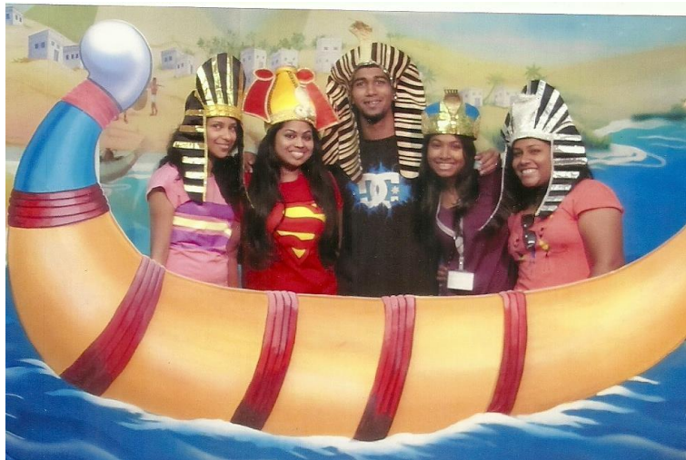
CSMVS Museum: Egyptian 'Mummy' Exhibition (2012-13)