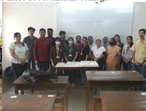
Session II: 19 April, 2022