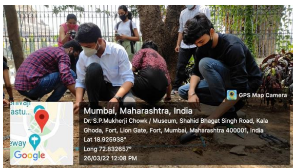
Session I: 26 March, 2022