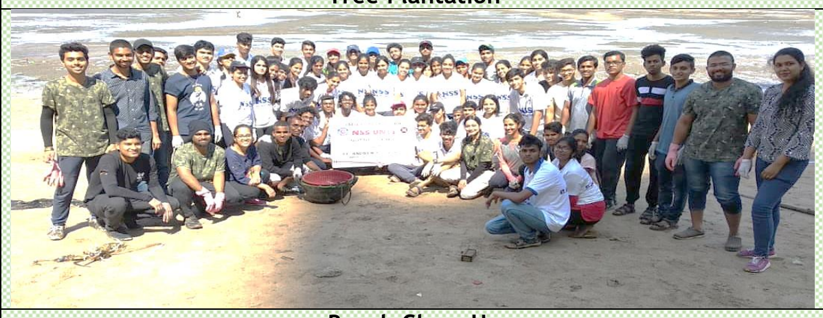
Beach Clean Up