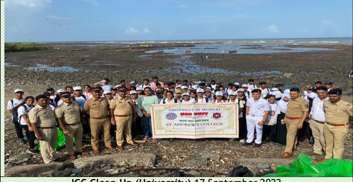
ICC Clean Up (University) 17 September 2022