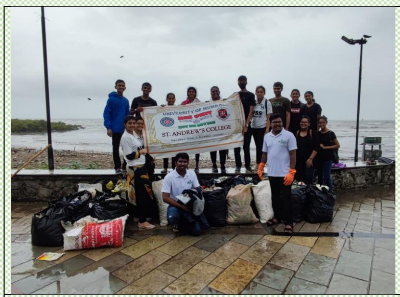
Mangroves Week- 24 July 2022