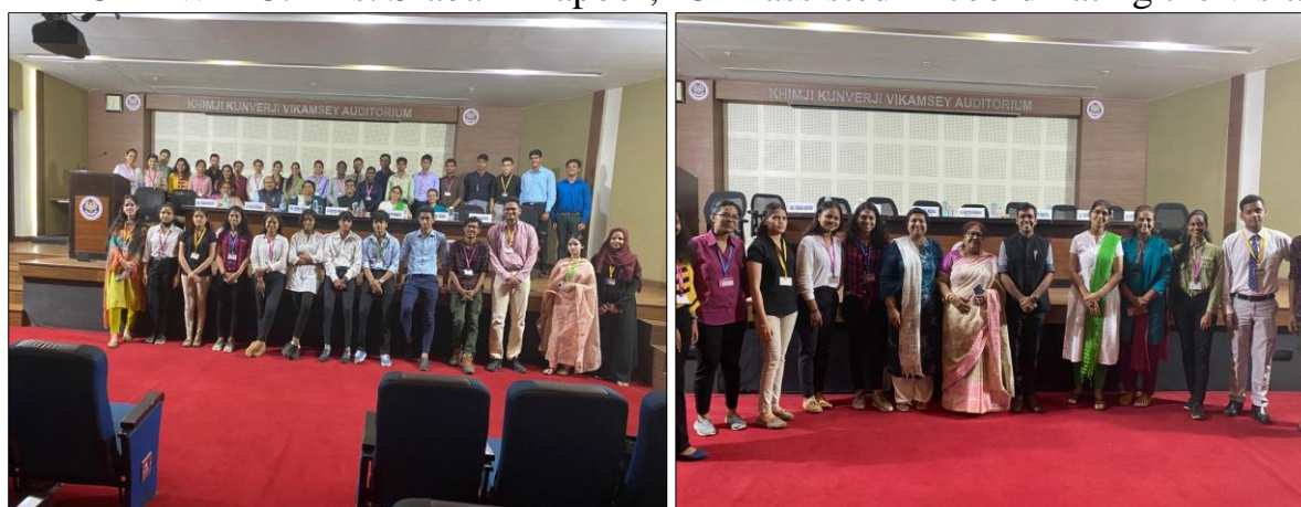
Visit to ICAI, BKC Camp