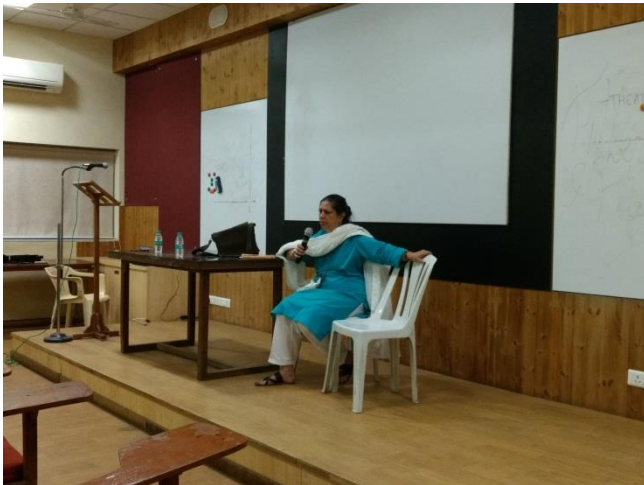
Rinki Bhattacharya Activist and Film maker discussed on issues related to physical and sexual abuse in marriage and relationships.