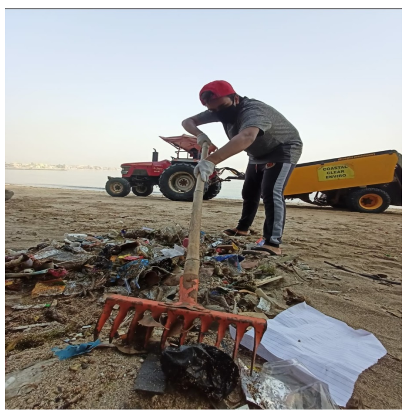
Beach Cleaning Day 1