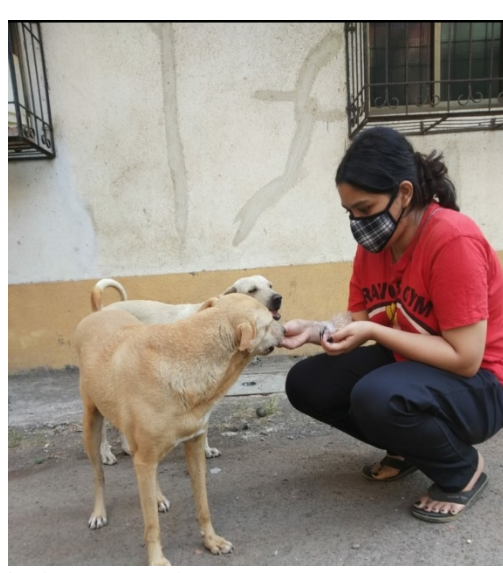
Animal Feeding – Dogs