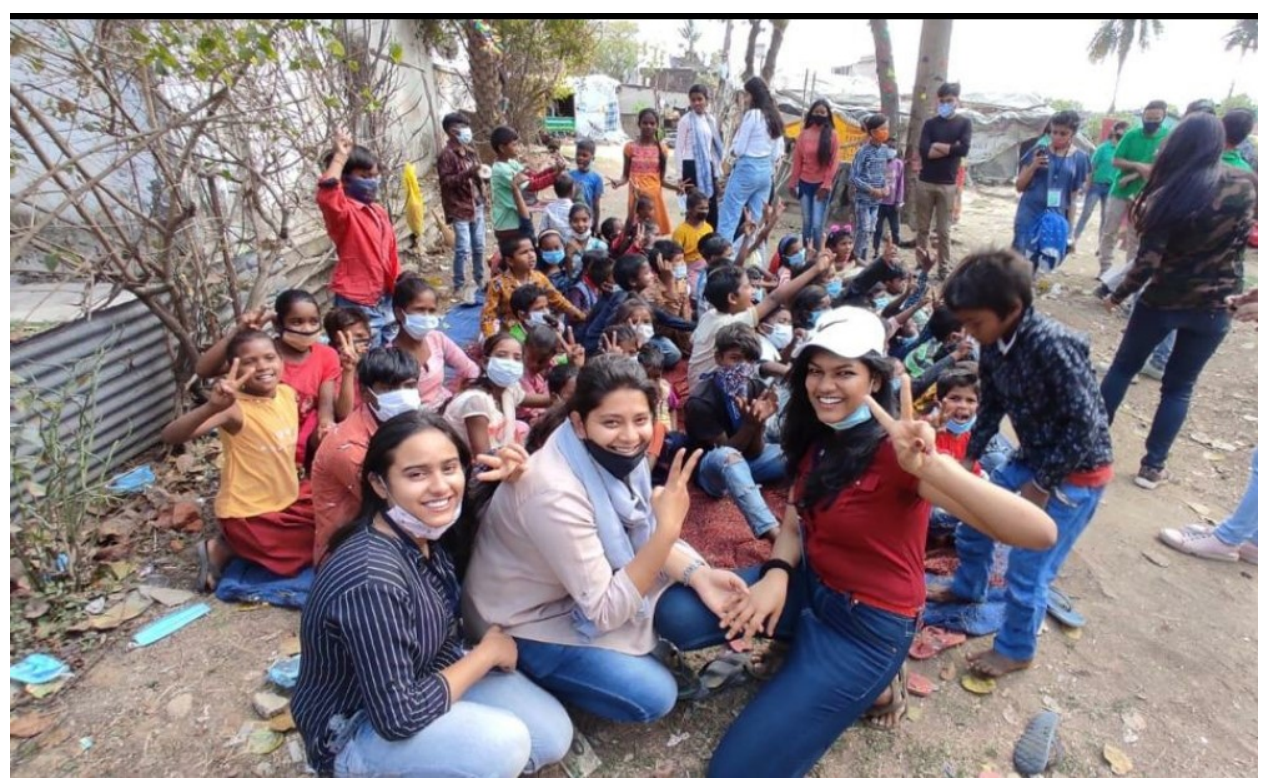
Society & Surrounding Community Activity - Supplies provided to street children & families