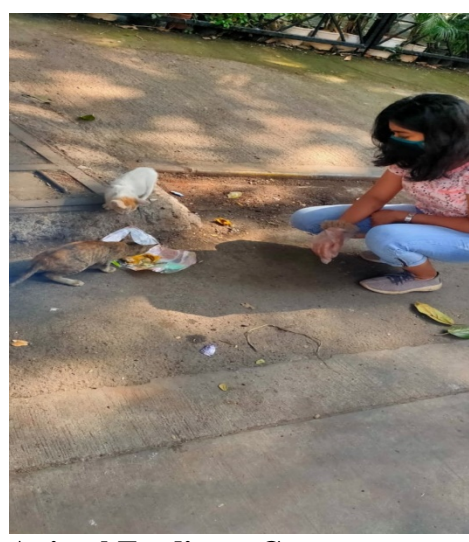
Animal Feeding – Cats