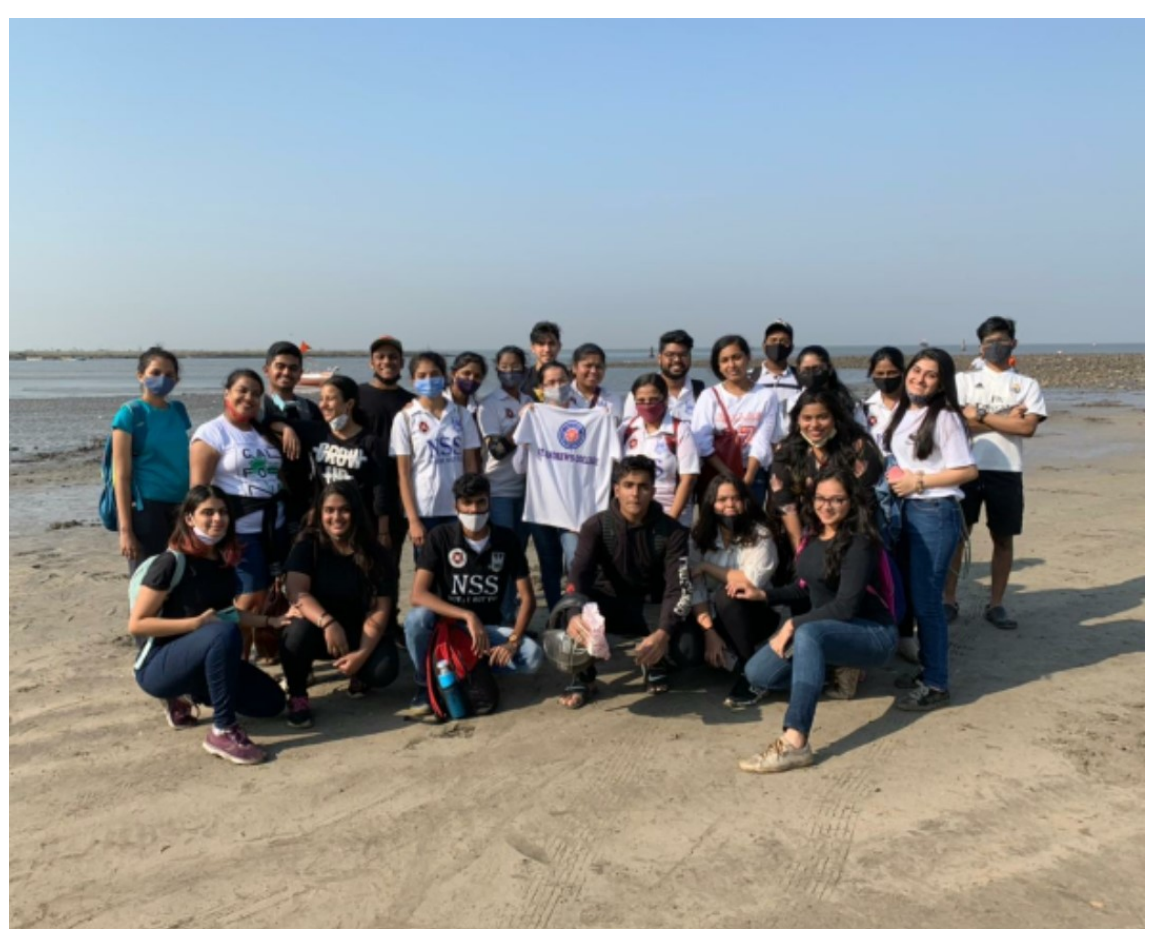
Beach Cleaning Team Day 2