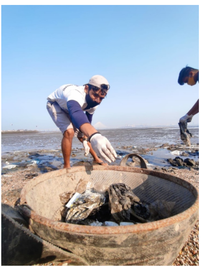
Beach Cleaning Day 2