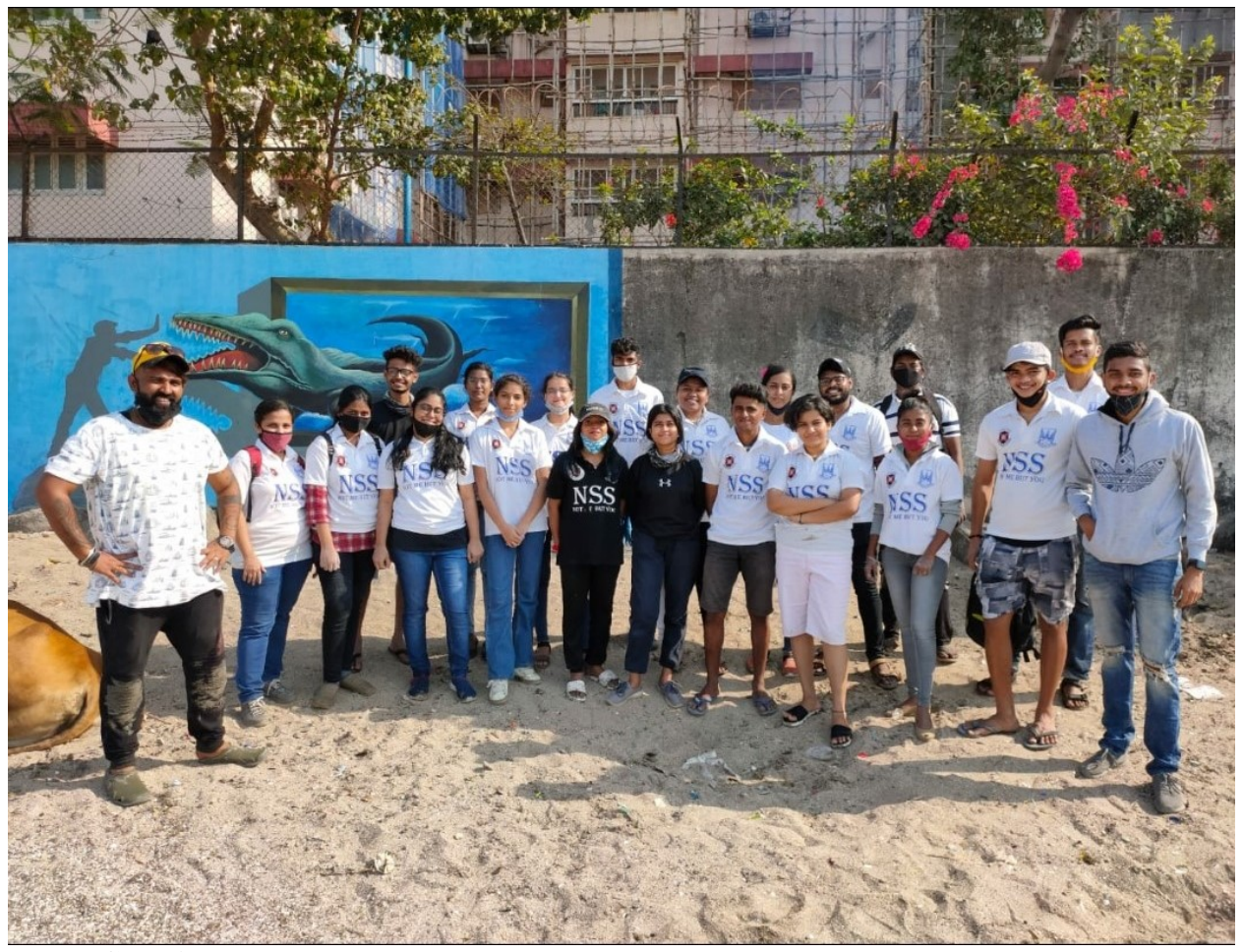
Beach Cleaning Team Day 1