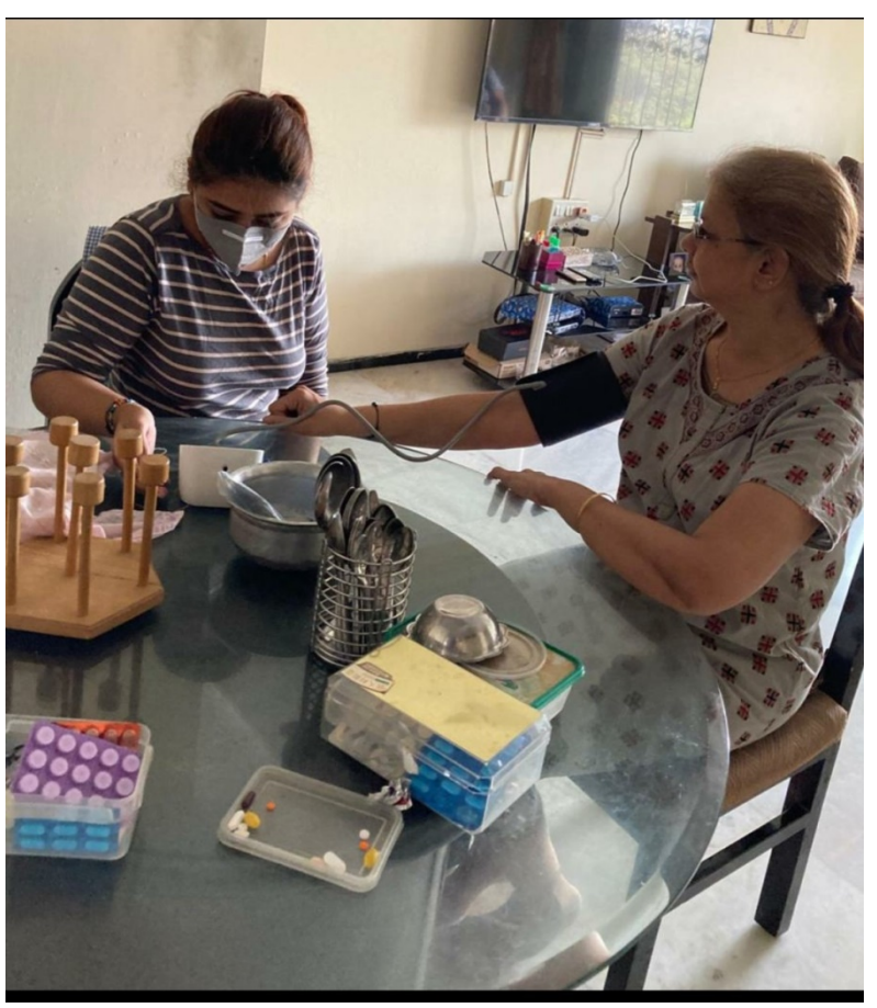
Society & Surrounding Community Activity - Medical support