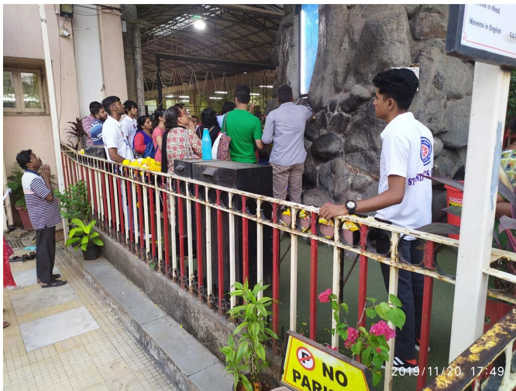
Mahim Novena - Crowd control