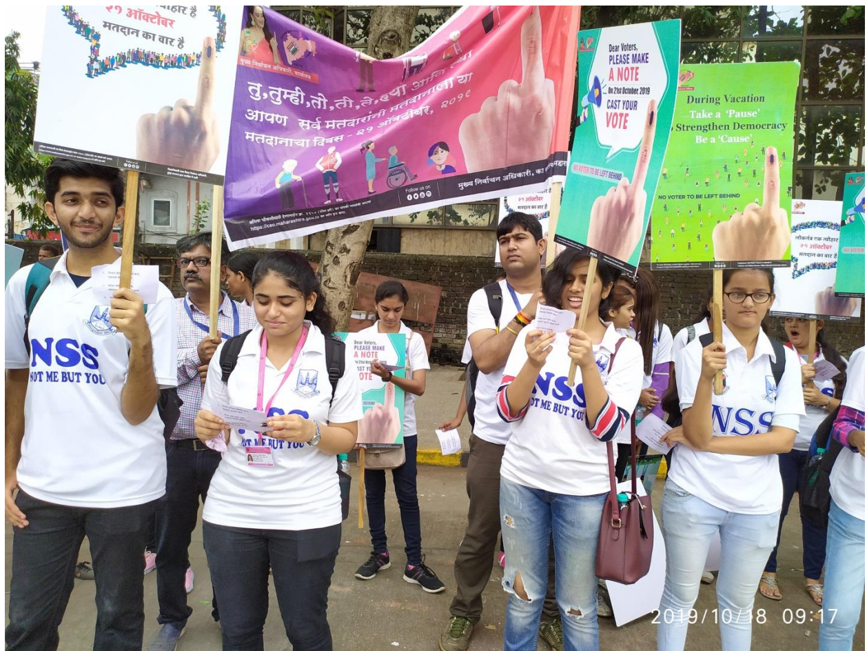
Voter Awareness Rally