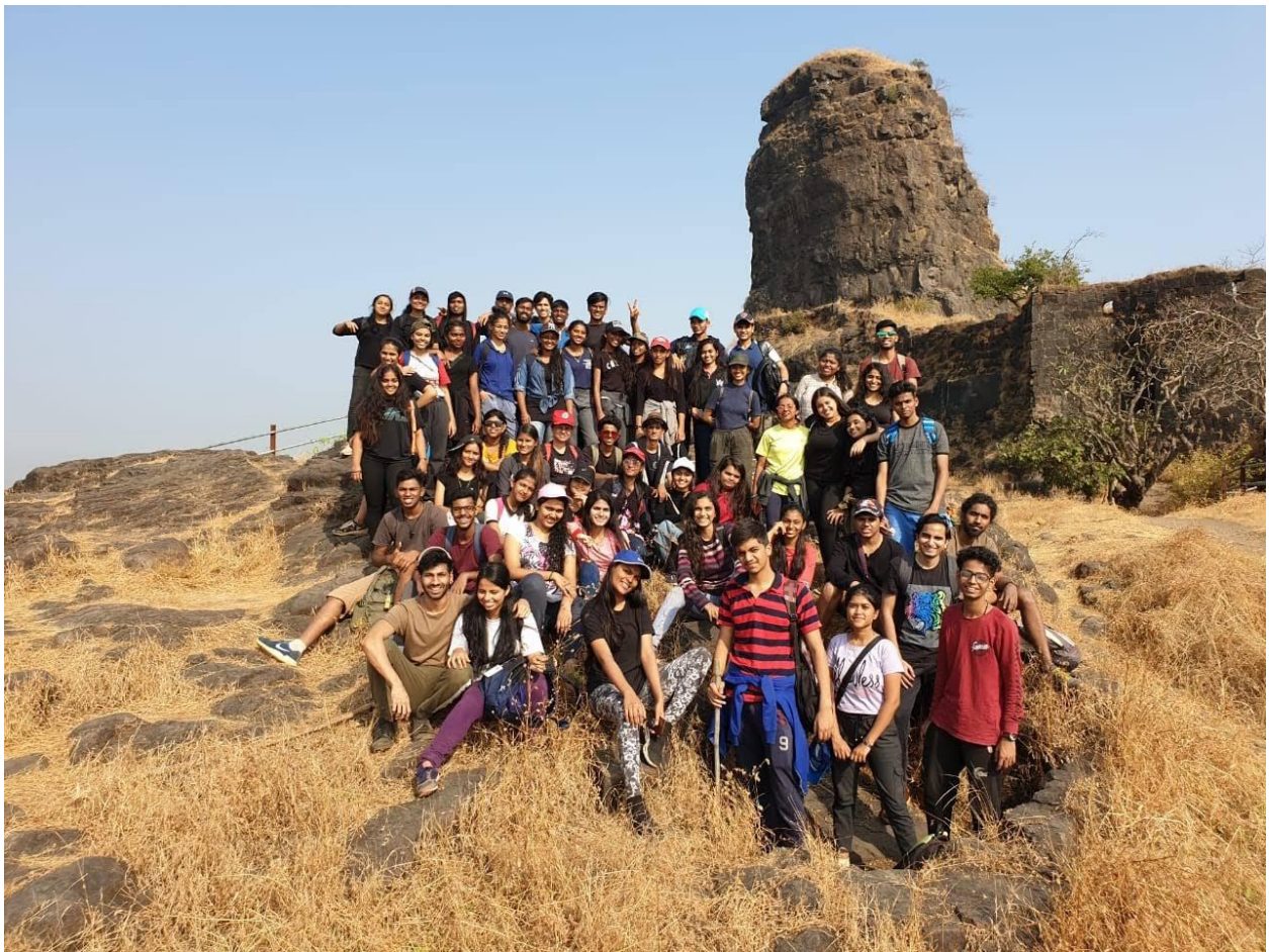
Rural Camp - Nature Trek - Karnala Summit