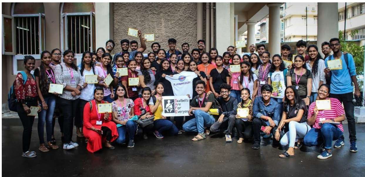
Road Safety Awareness - Street Play & Pledge