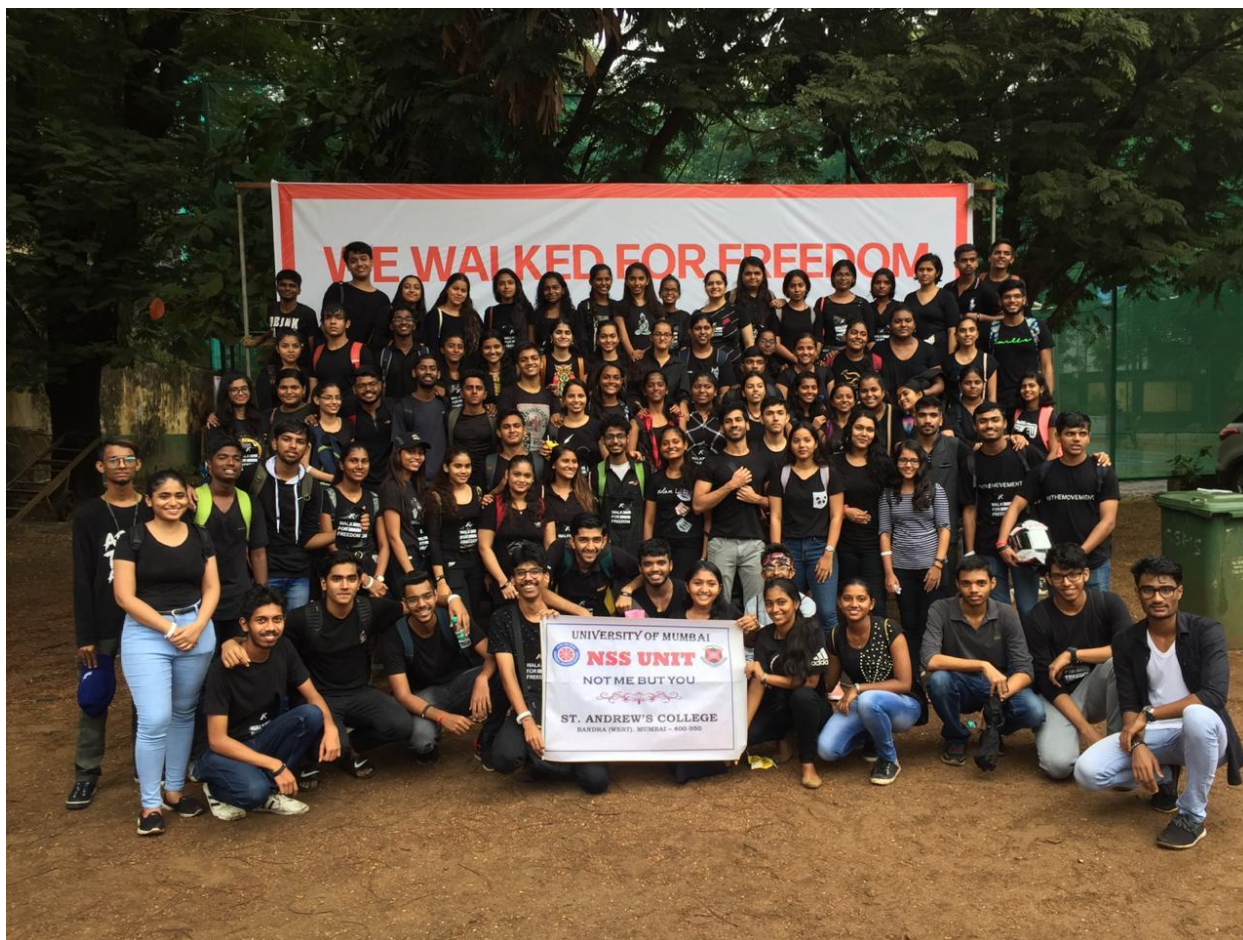
Walk For Freedom - Against Human Trafficking