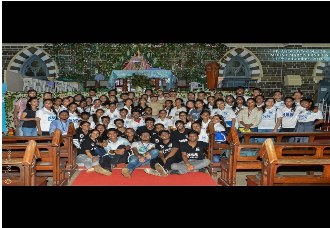
Bandra Fair - Full Team