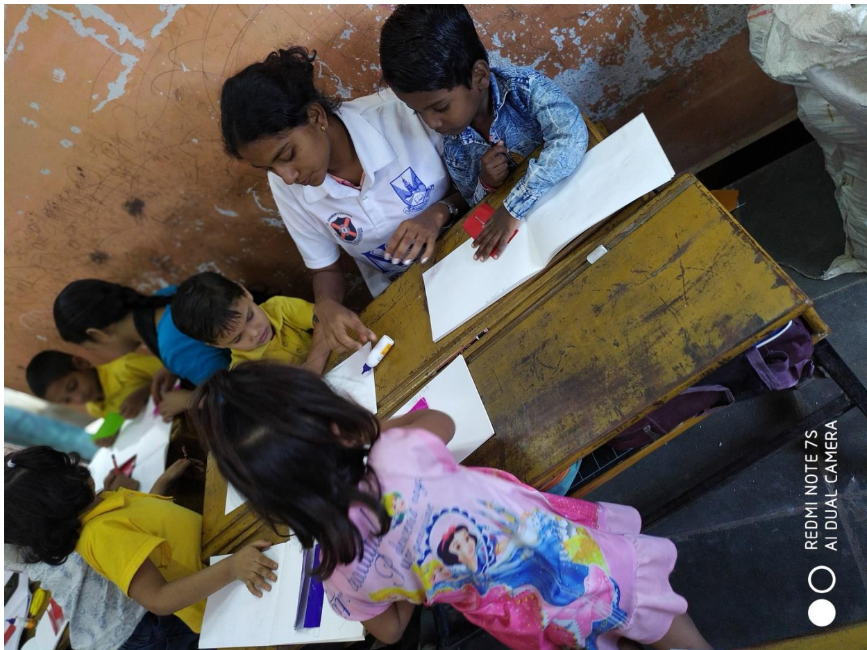
Mission Admission - Teaching kids