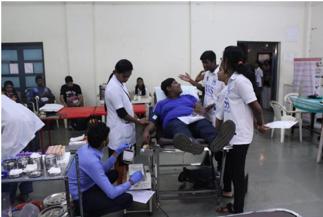
Blood Donation - Encouraging & Thanking Donors