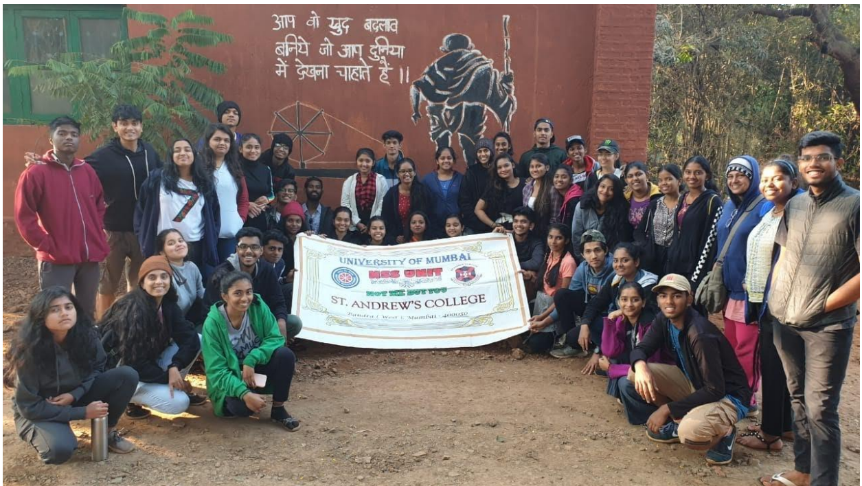
Rural Camp - Painting done by volunteers at Yusuf Meherally Centre