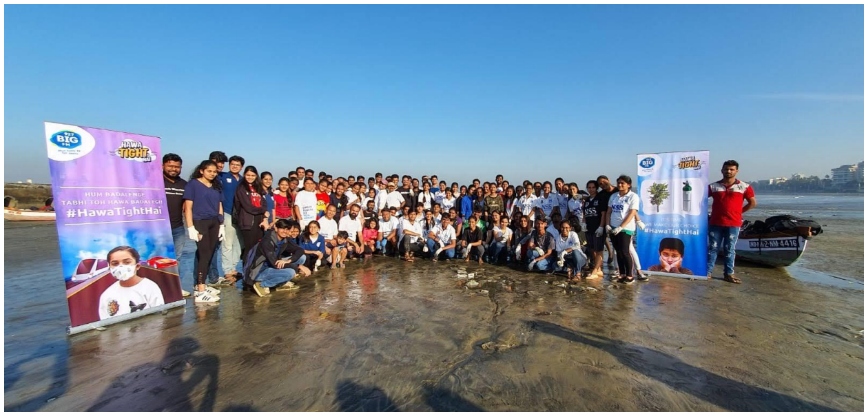
Beach Cleaning – Team