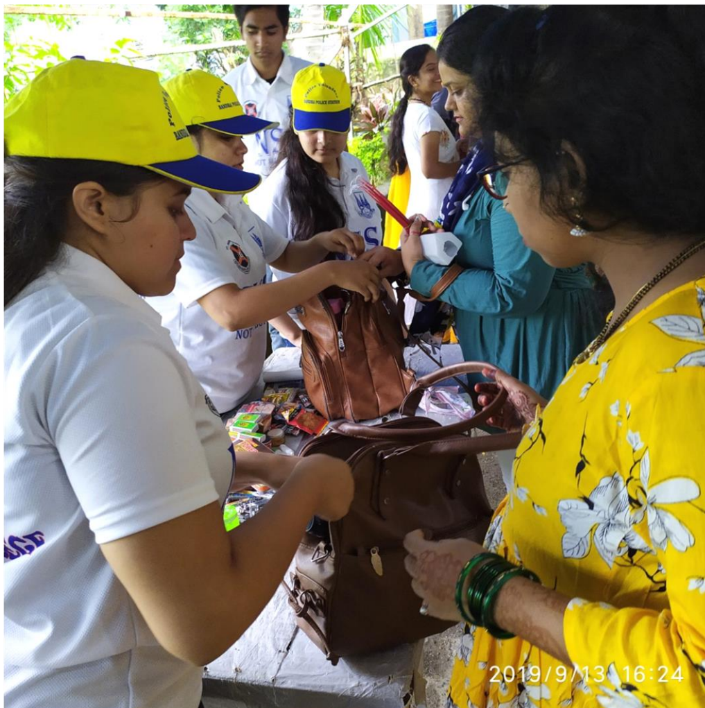
Bandra Fair - Security Check