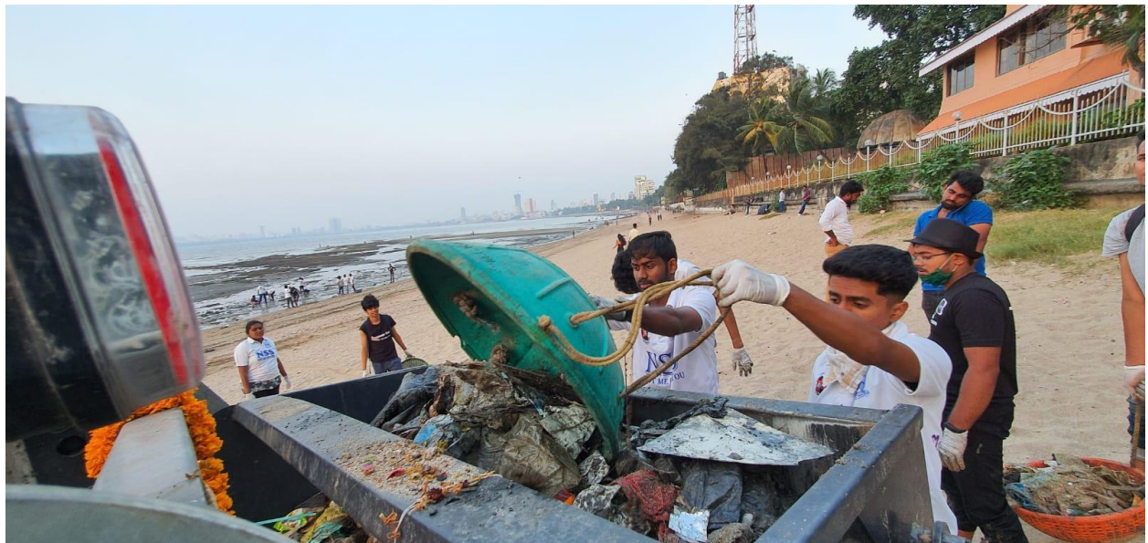
Beach Cleaning - Where it belongs