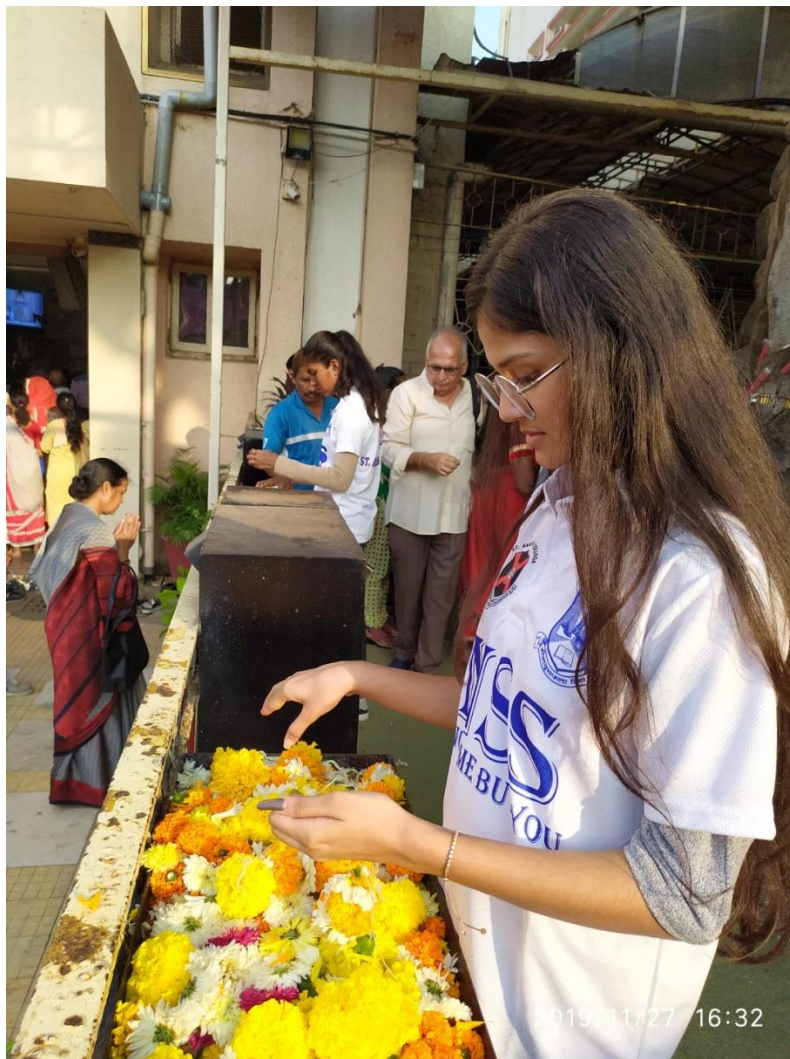
Mahim Novena - breaking used garlands to ensure it is not sold again