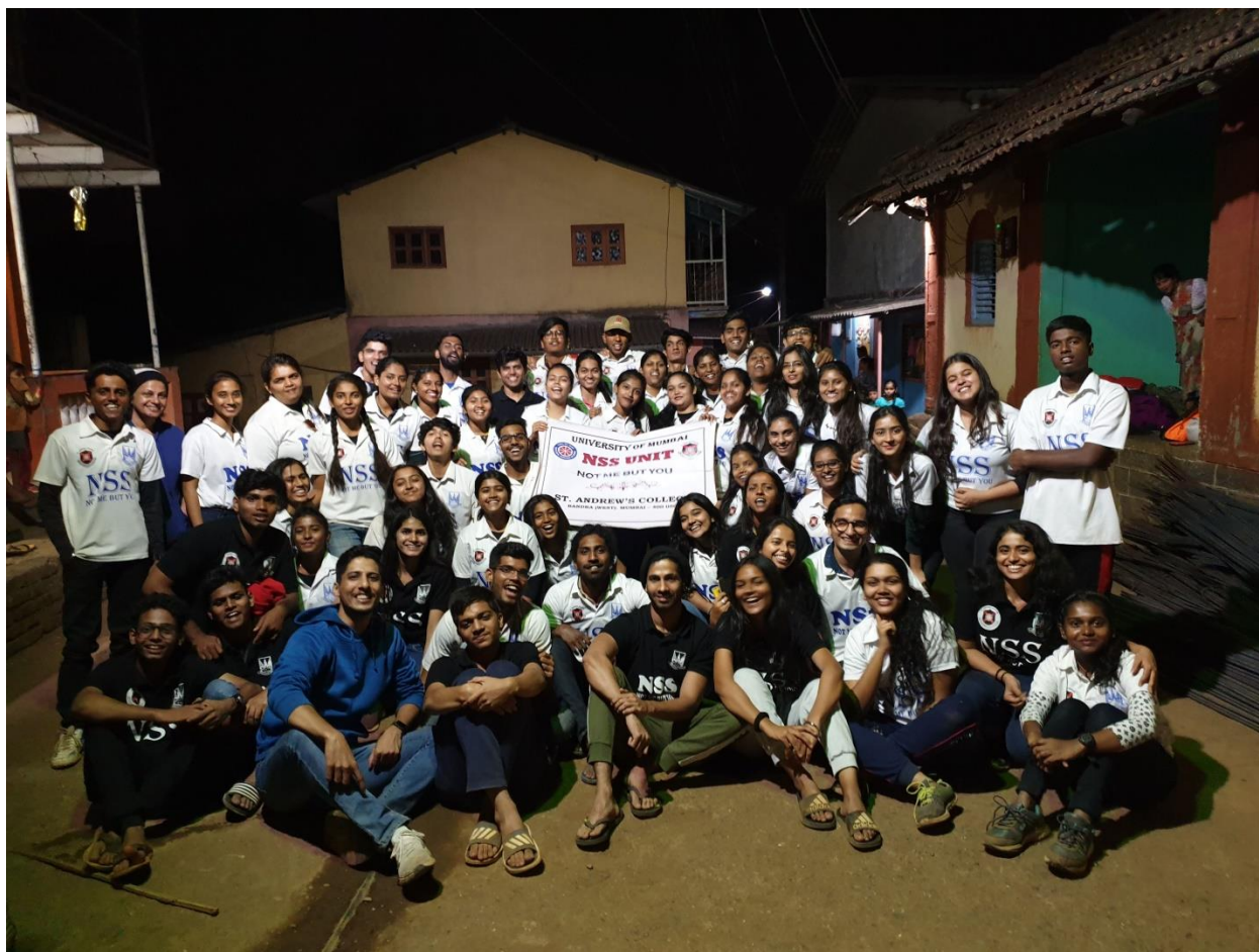
Rural Camp - Smiles Post Street Play Performance in the Village