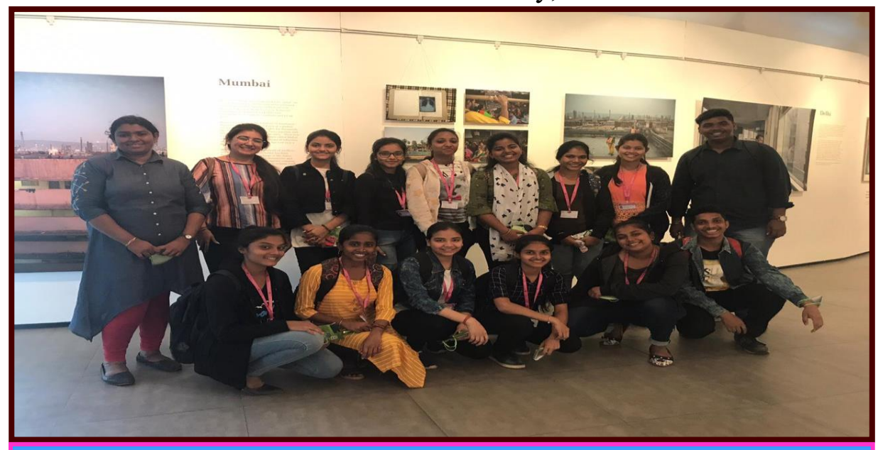
At the exhibition Breathless, Bombay Art Gallery

A visit to exhibit of a working model of human lungs with a real-time display of Air Quality Index outside National College followed by visit to exhibition at Bombay Art Gallery entitled 'Breathless' was conducted on 30 January, 2020.