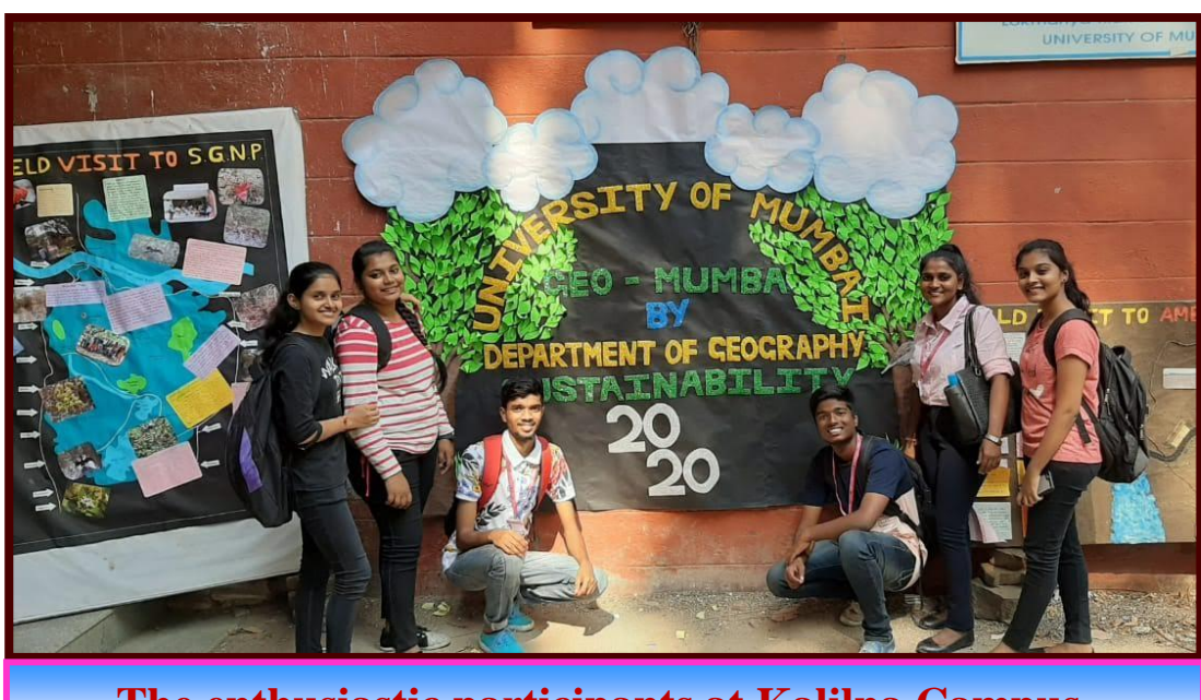
The enthusiastic participants at Kalilna Campus.

• Students participated in an inter-collegiate environmental quiz Sustainability 2020. One of our teams secured first prize.