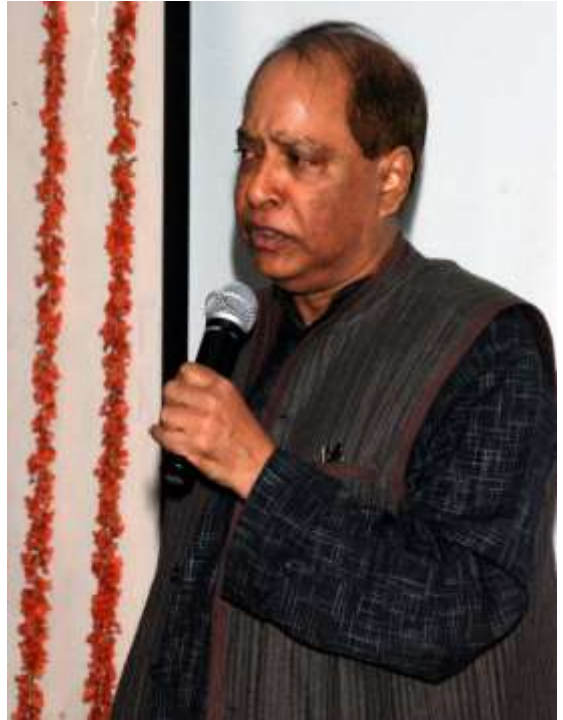
Honourable Commissioner for NRI Affairs, Mr. Eduardo Faleiro