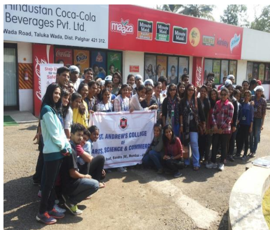
(Picture 10 and Picture 11- Students along with faculty at the Plant-Industrial Visit – Coco-Cola – 2015-16)