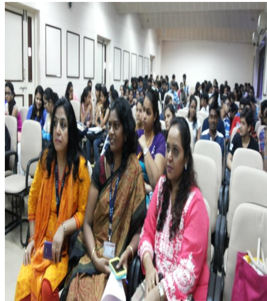
Picture 1 and Picture 2 – Seminar for TYBCOM students on Career Counseling)