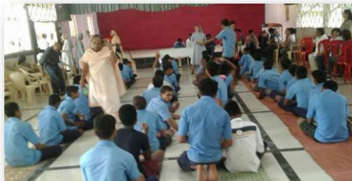
Visit to Our Lady of Fatima Church By Faith on Campus group

A priest has been appointed by the archdiocese to provide the necessary spiritual guidance to students. In addition, theology classes, retreats, and recollections are also organized. The College has a group named Faith On Campus that organises various faith-based programmes every week.