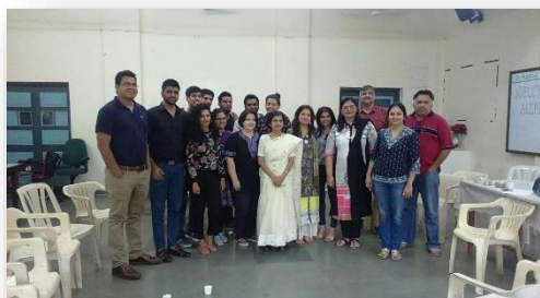
ALUMNI committee 2017

St. Andrew's College Alumni (S. A. C. A.) was initiated in 2006 with the objective of having a mutually beneficial relationship between the college and its ex-students. The association will offer students the opportunity to give back to their alma mater some of the knowledge and skills they have gained from St. Andrew's. The organization is in its infancy and in the process of collecting members. As it grows in number with the passage of time, it will engage in a much bigger way the resources and services of ex-students for the benefit of current students.