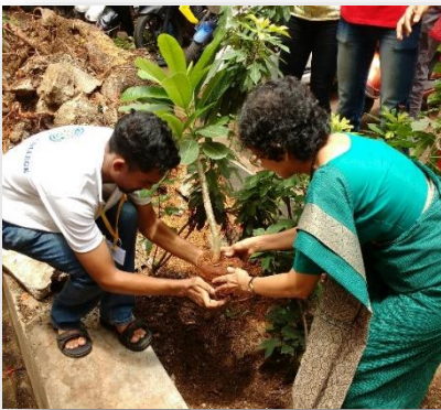
NSS tree plantation