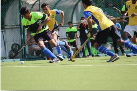
Sports at St. Andrew's Turf