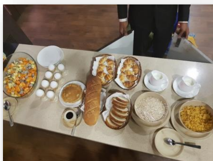
English breakfast setup

If a candidate has already passed her/his Three Year Diploma in Hotel Management from any recognized Board in India or abroad she/he will be admitted directly to the third year of the B.Sc. (H. S.) course to facilitate her/ him to convert her/his Diploma into a Degree.