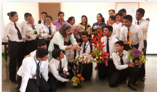
Flower arrangement workshop