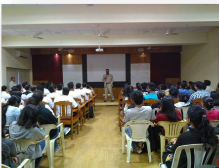
Value Education session

This programme benefits students psychologically, helps them improve their communication skills, improves cooperation and imbibes responsible citizenship in them, encourages them to have a new perspective to life and make positive lifestyle choices and behavior.