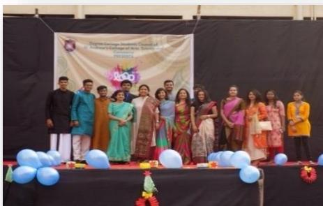
Student's Council- LOOP 2017-18