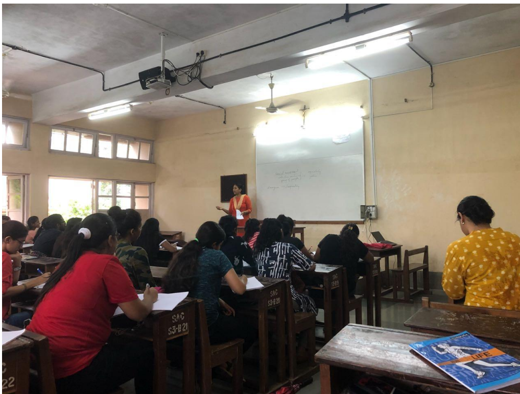
Session on sexual harassment forms, concerns and legal interventions for SY and TY students by class teacher