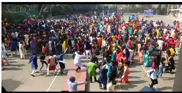
TRADITIONAL DAY (2018-2019)