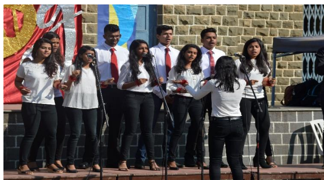
INTER DEPARTMENTAL CAROL SINGING