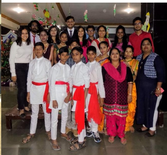
CHILDREN FROM MUSKAAN