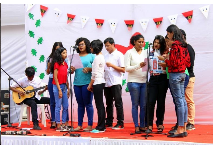
RINGING THE CHRISTMAS SEASON.