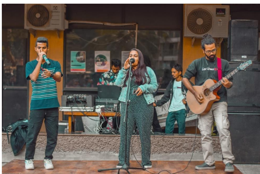
BELTING IT OUT AT THE OPEN MIC.