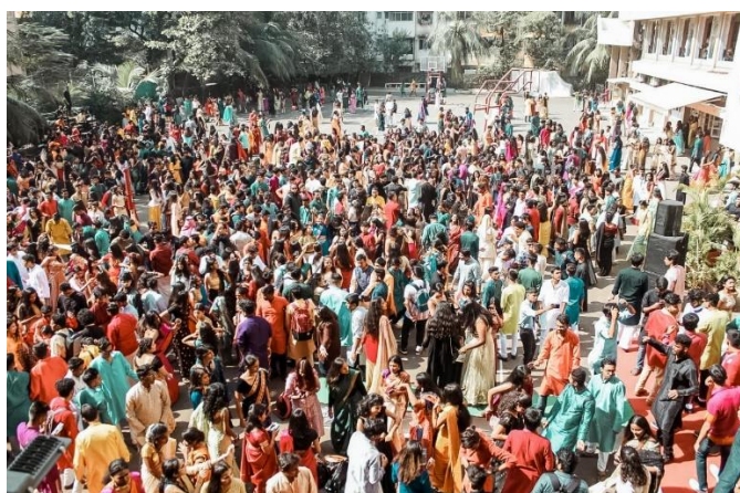
TRADITIONAL DAY (2019-2020)