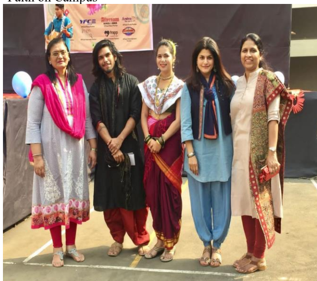
MR & MS LOOP (2017-18)