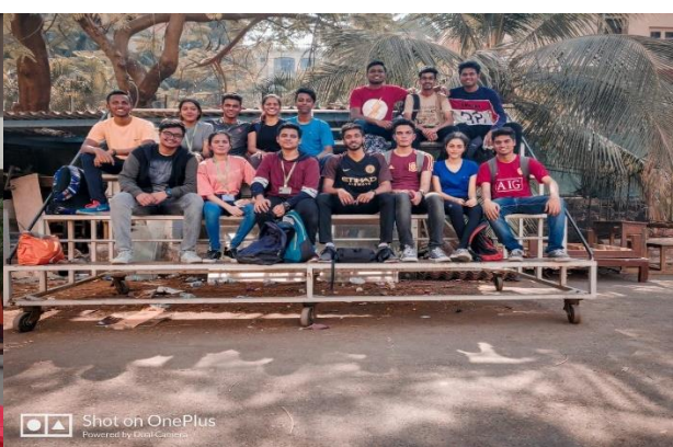
WINNERS OF TREASURE HUNT- LOOP 2019