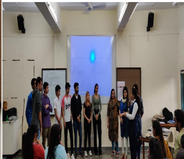
(Picture 11 –crazy Marketing Competition, Picture 12- winners of shark tank and crazy marketing competition)