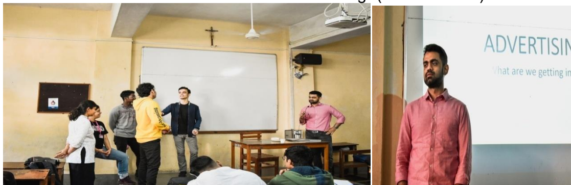
(Picture 1-Students doing role play as functional heads of the Advertising Agency and taking decision over a project- workshop picture)