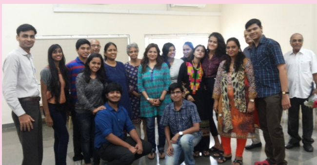
Winning Team of Debate competition