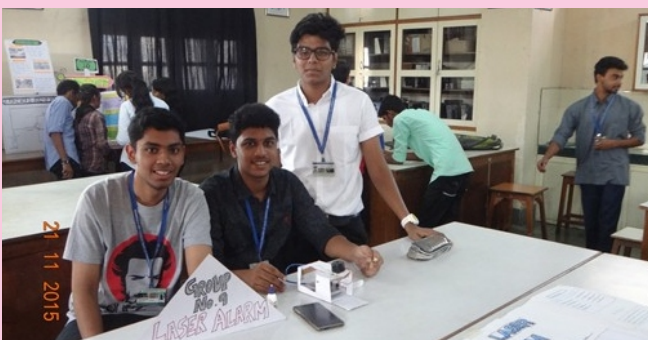
ECT Exhibition - Students with their Project