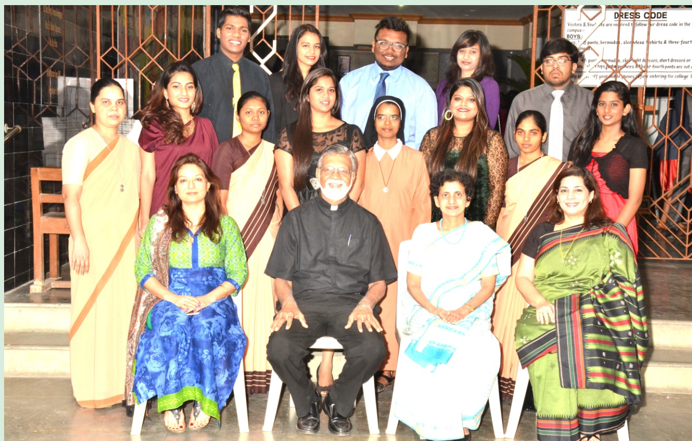
T. Y. B. A. History