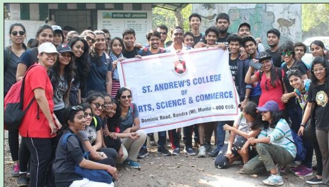
Visit to Karnala Bird Sanctuary