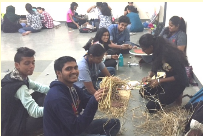
Crib making competition