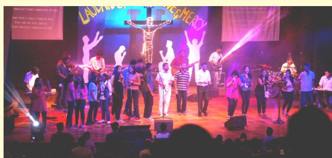
Our melodious Andrean Gospel Band