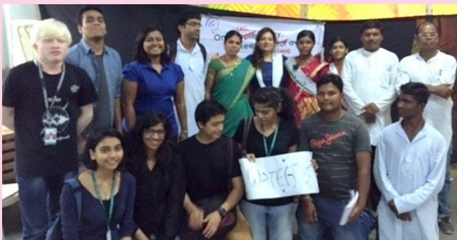
Street play by CGNetSvara on problems faced by tribals of rural India