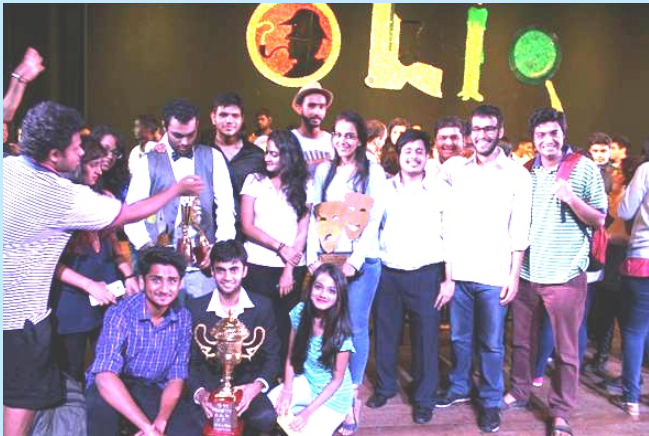
Proud Winners of various categories