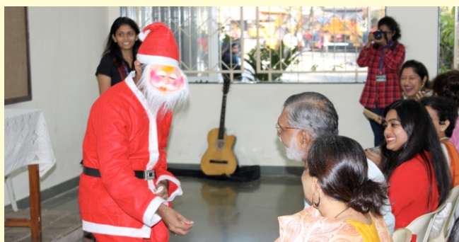
Santa Claus is in town!