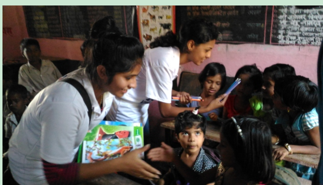
Education Drive during camp