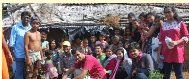
With the Balwadi kids at the village