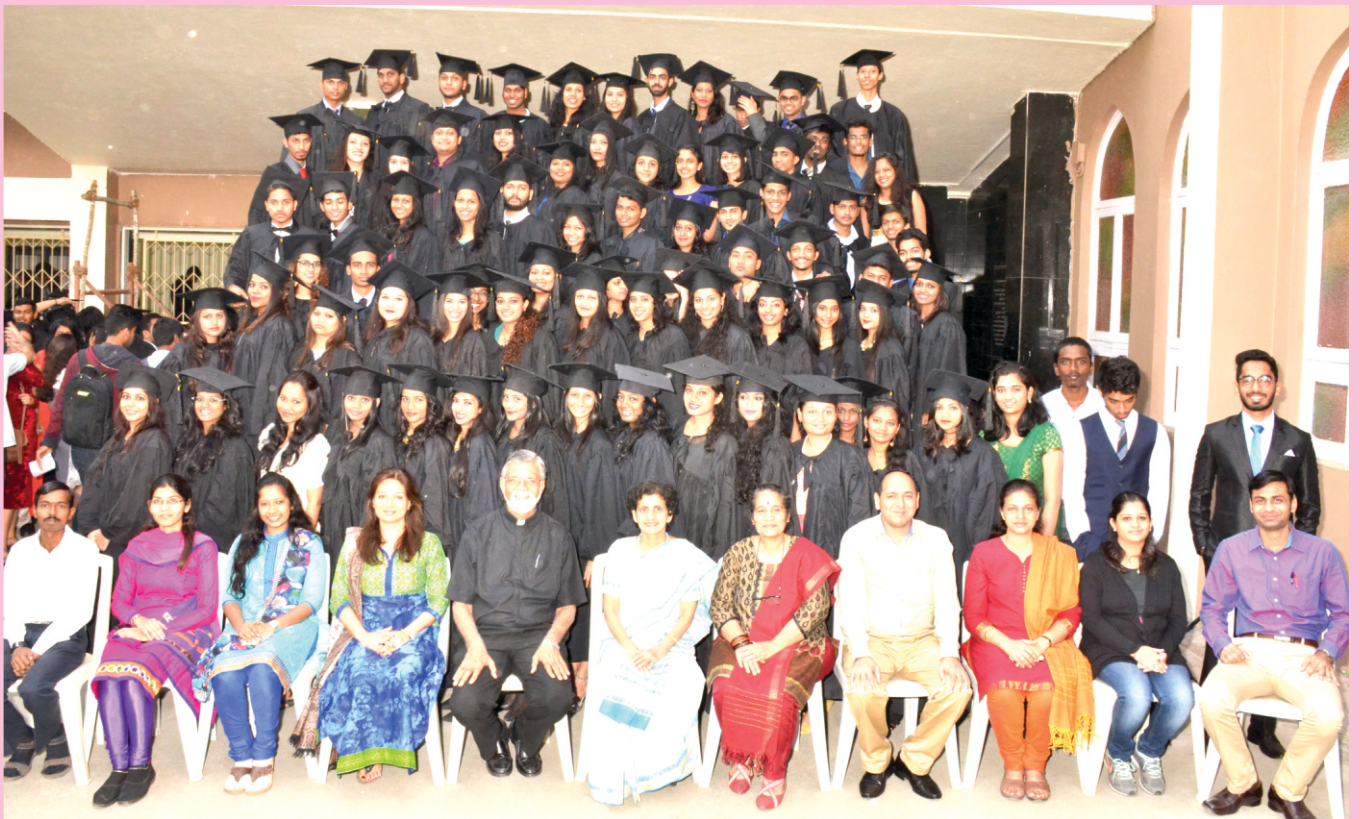
T. Y. B. Com. Div. - A