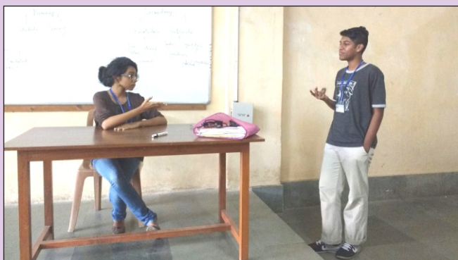
Department of Sociology-Role play