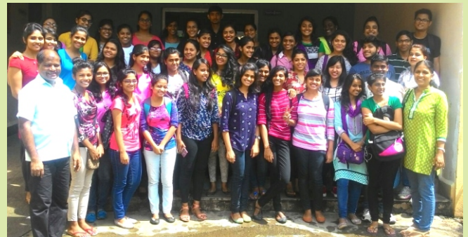
Visit to Sneha Sadan, Borivali