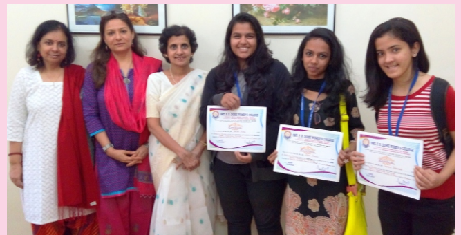
Participants of Trishool Psychology Convention