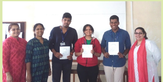
Socio-History Student Seminar