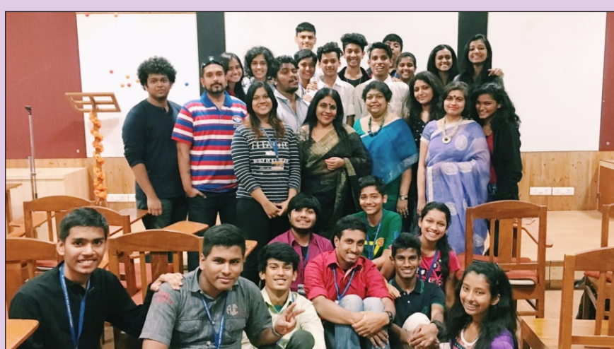
Department of English- Seminar on Doorstep Schooling