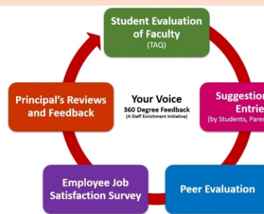
YOUR VOICE - Staff Enrichment Initiative - 360 Degree Feedback