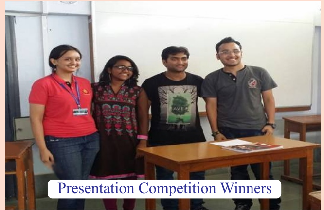
Presentation Competition Winners