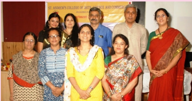
Department faculty with the paper-presenters