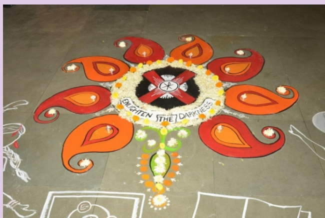
Welcome to all !