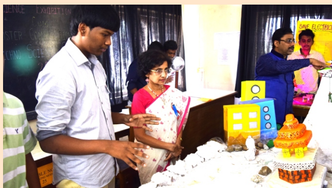
Principal with the participants