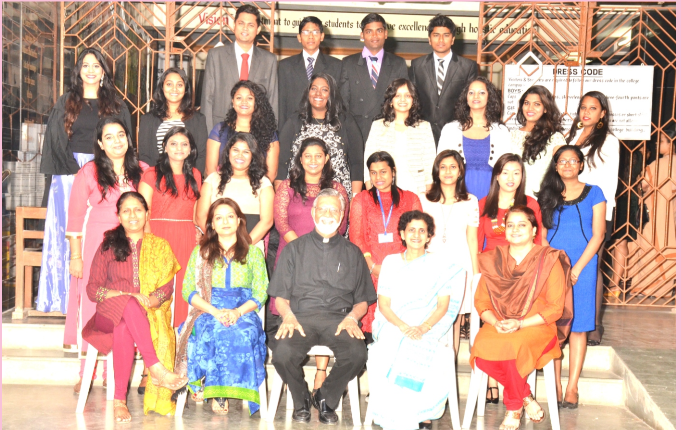
T. Y. B. A. Sociology