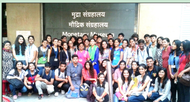
Visit to Monetary museum