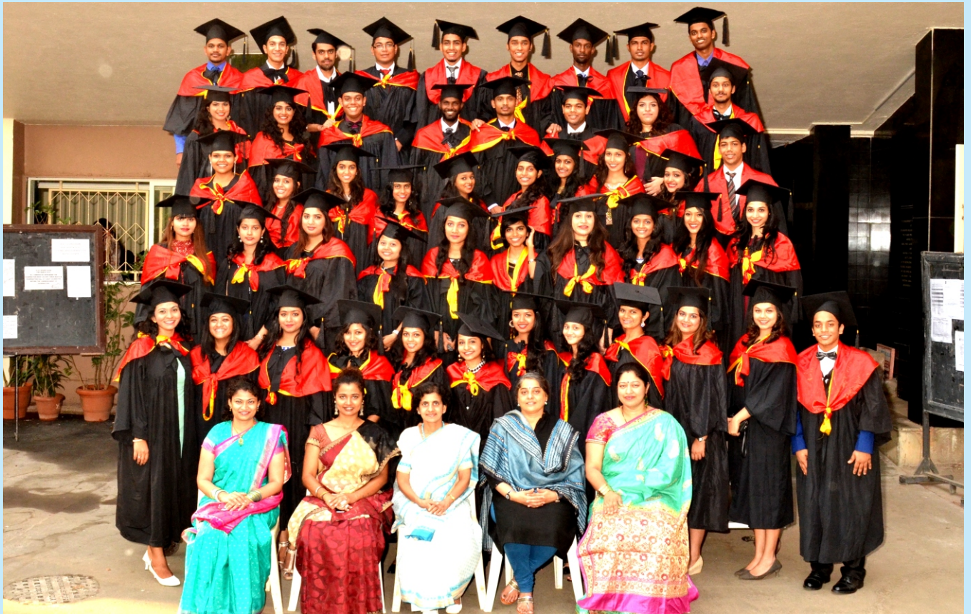
T. Y. B. M. S. Div. - A