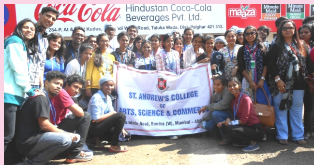
Industrial visit to Wada Coco-Cola Plant