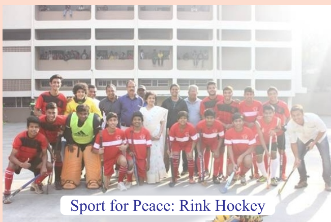
Sport for Peace: Rink Hockey