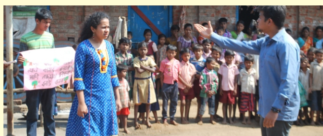
Street play at tribal camp