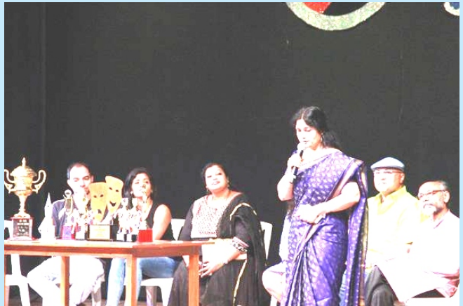
Final Result declaration in presence of the OLIO judges