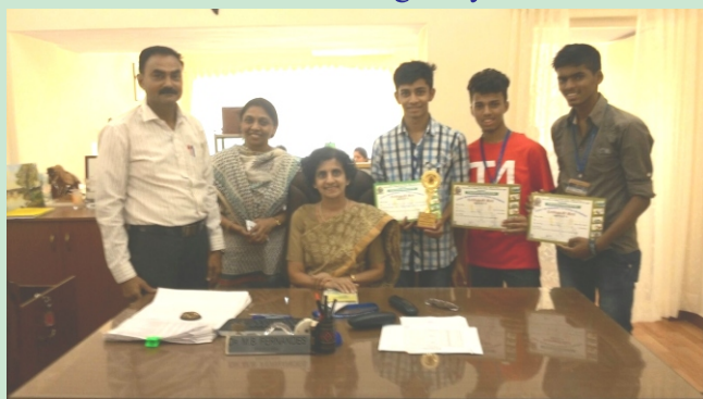
Winning Team at H –Ward Science Exhibition organized by Education Department