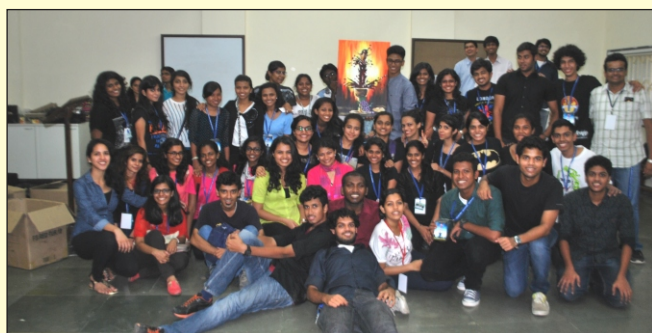
Organising team of Laudato Si' with the prize winning work of art