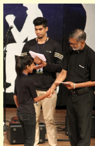
Prizewinner of 'Sola Scriptura', Bible quiz