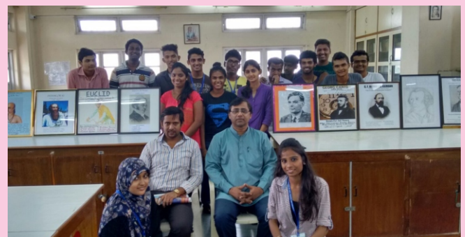
Famous Mathematicians – Photo Exhibition