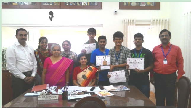
Andreans – Winners at the Techno-Science galaxy 2015.