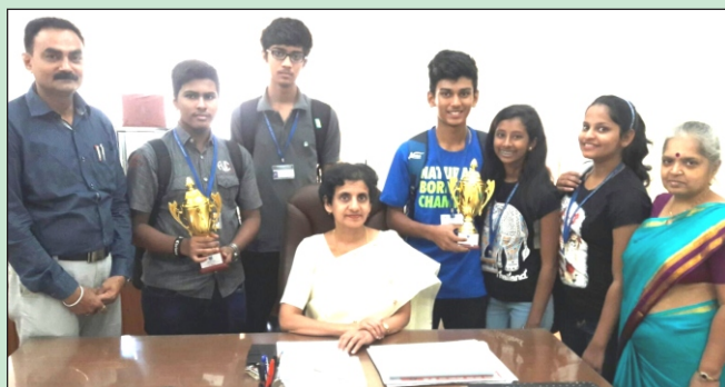
Winners at Science Exhibition PHYZEX-2015 organized by Jai Hind College