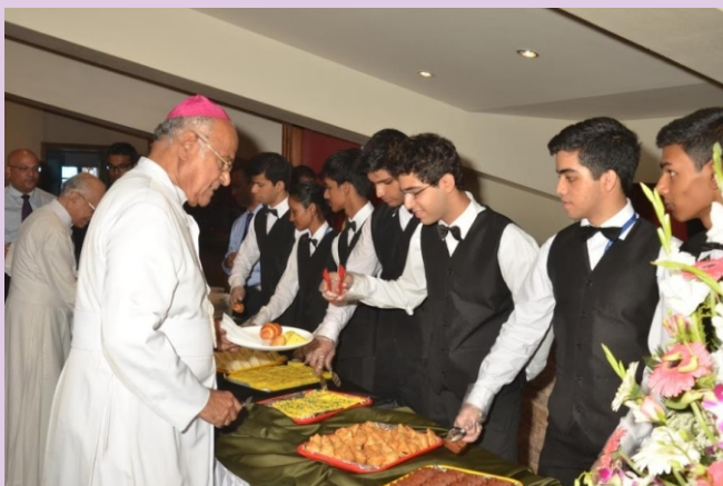
Hospitality students at service