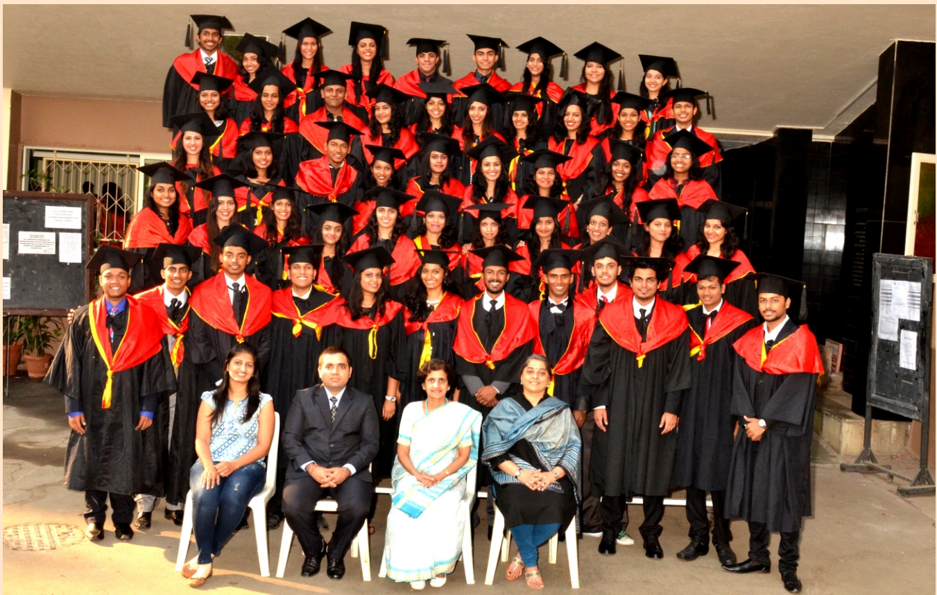
T. Y. B. Com. (A & F)