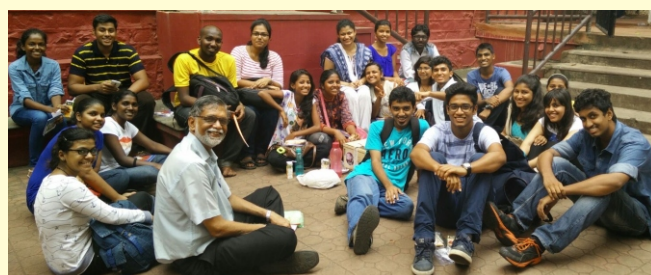
Pilgrim to the Mount Mary shrine