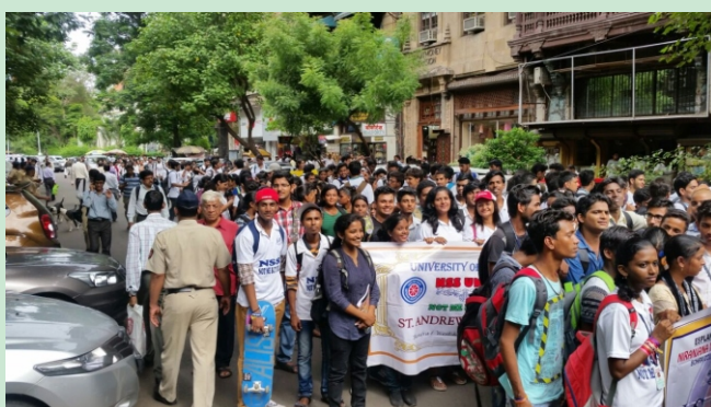
Peace Rally at Azad Maidan