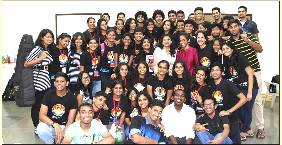
The happy organising team