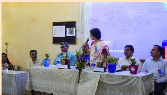
Principal with the Chief Guests