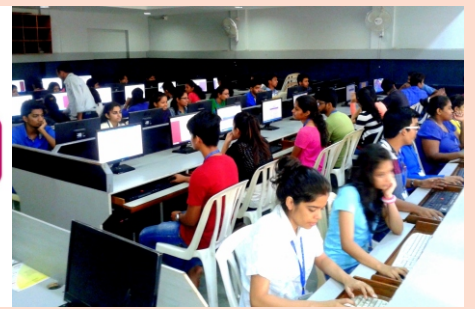
Students Feedback of Faculty (TAQ)