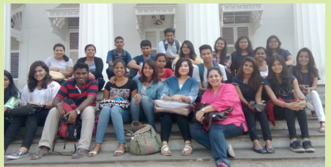
Heritage walk, Asiatic society