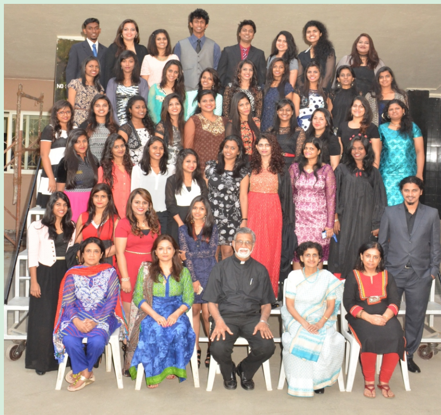
T. Y. B. A. Psychology