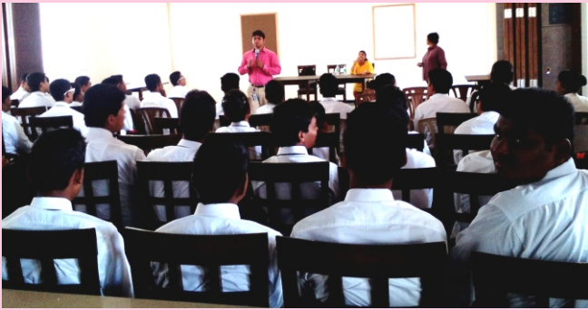
Guest lecture – Cleanliness & Cleaning services