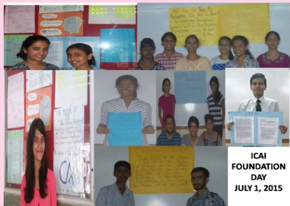
ICAI Foundation Day