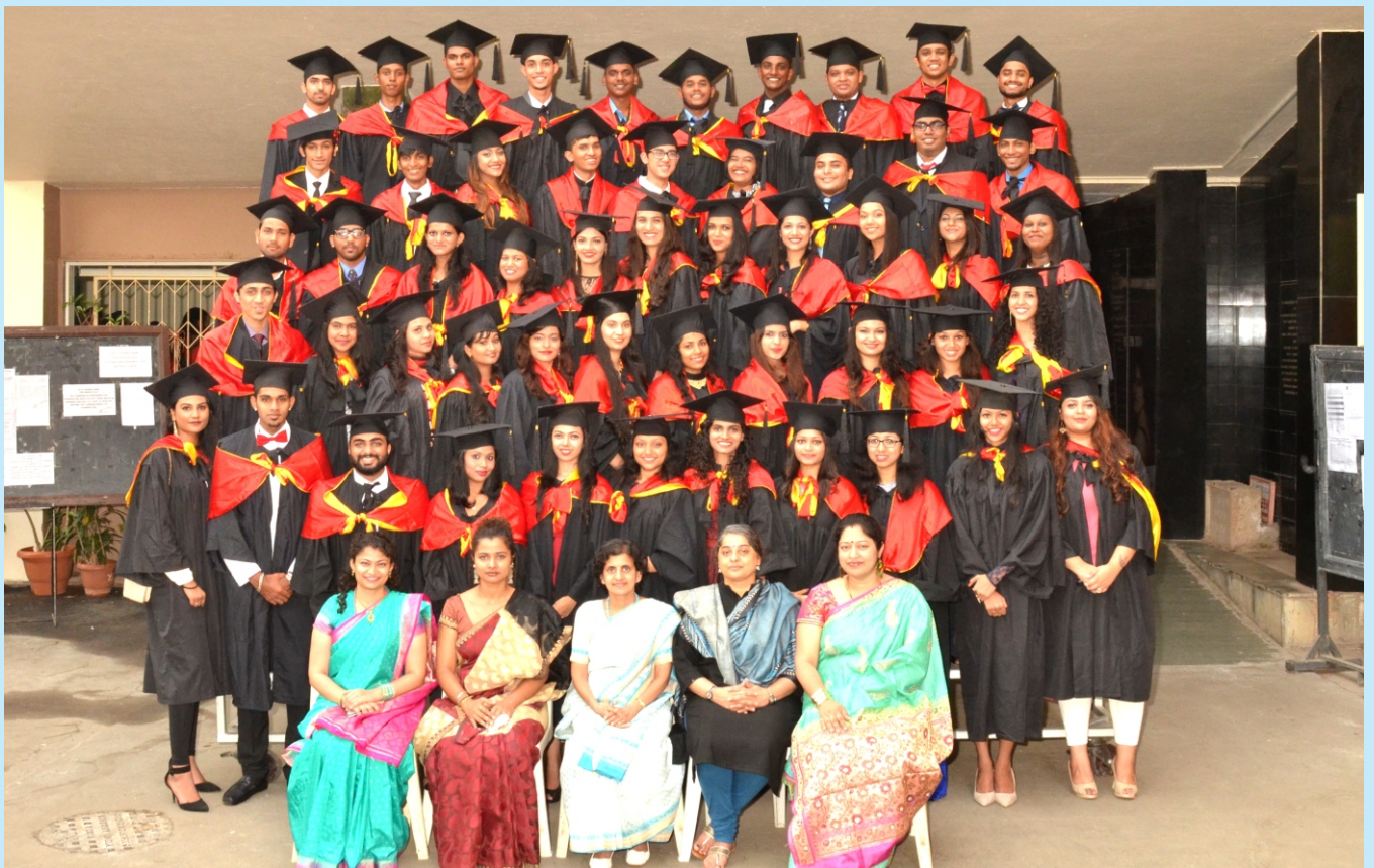
T. Y. B. M. S. Div. B