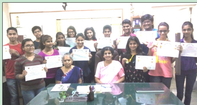
Winners at the KJ Somaiya Group