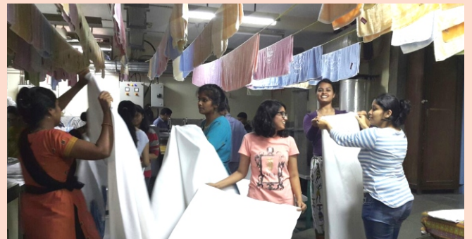
Doing the daily chores at Navjeet Society Center