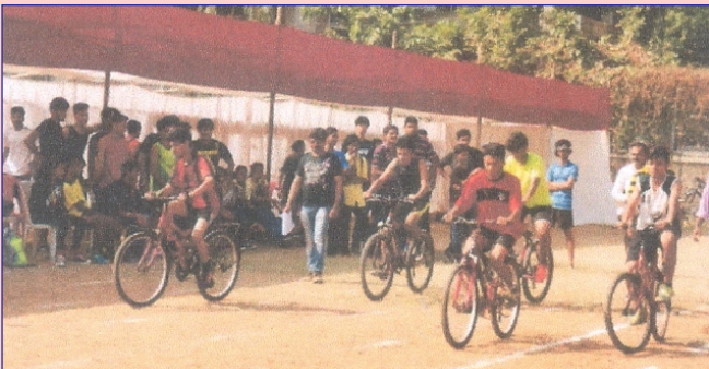
Slow and steady wins the race. (Slow Cycle Race)