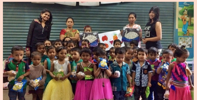
Time for some activities...