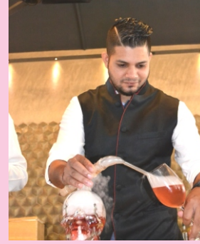
Cocktail Mocktail - Demonstration Session