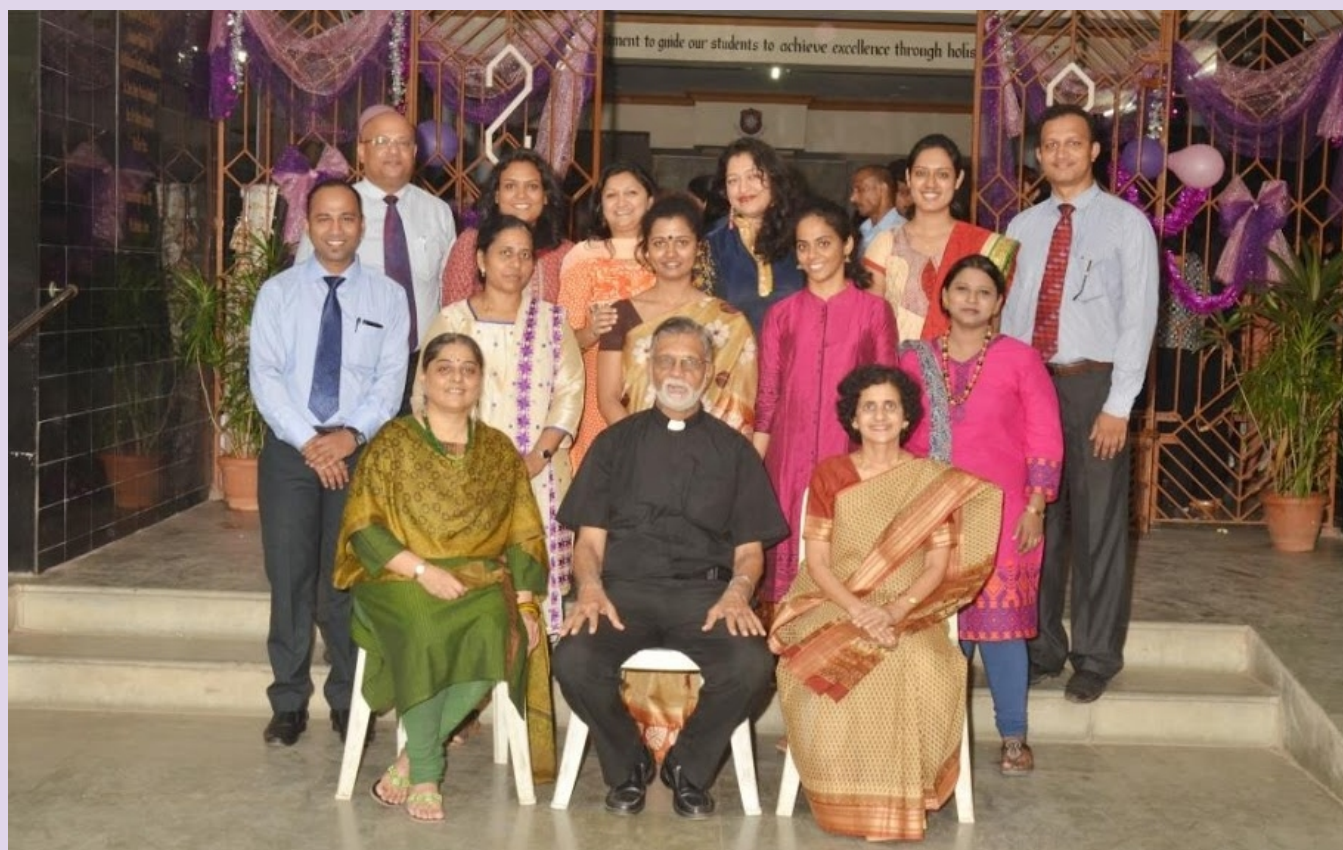
Teaching Staff - Self Finance Courses