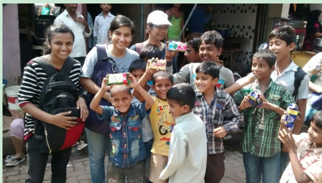
World Food Day