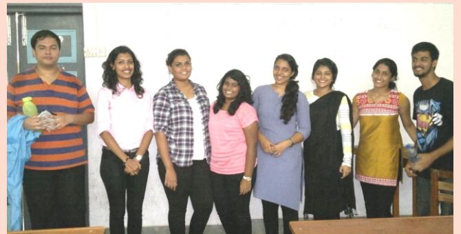
Street Play participants