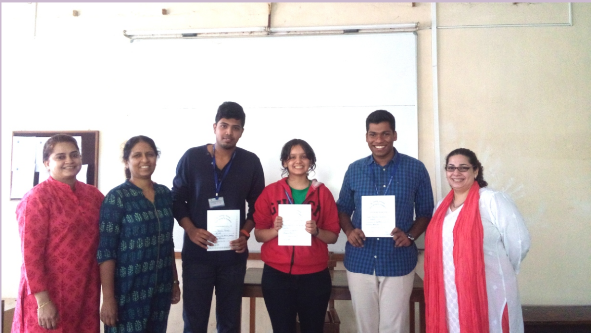
Socio History Student Seminar 2015-16: Tribes of Maharashtra