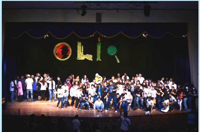
Talented and hardworking OLIO Team