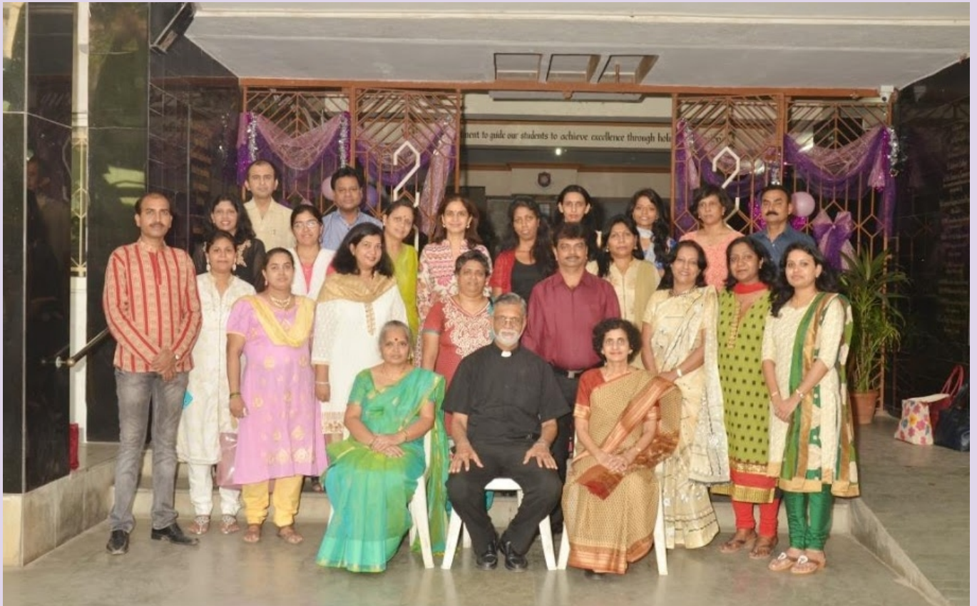
Teaching Staff - Junior College