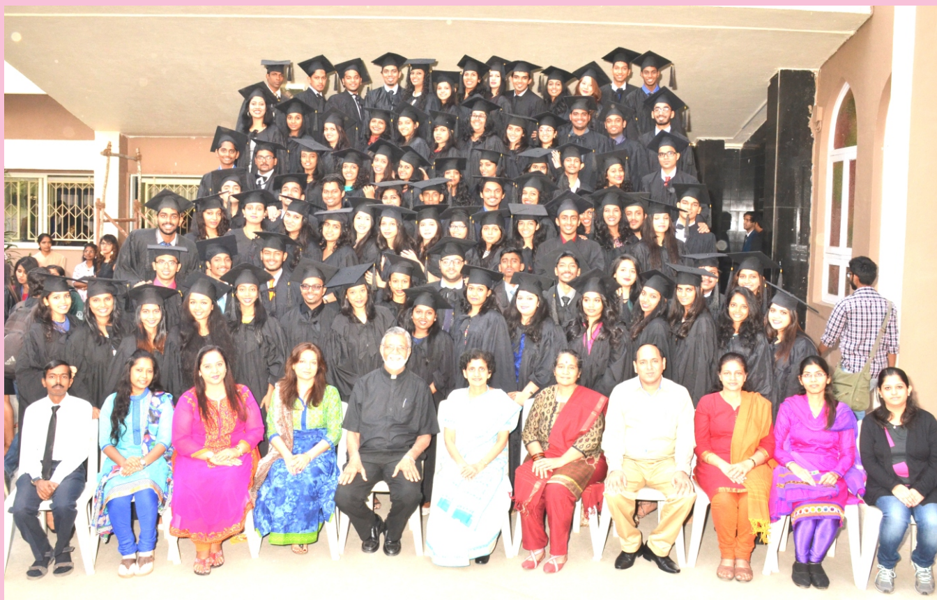
T. Y. B. Com. Div. - B