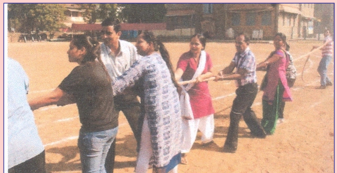
Staff ready to pull