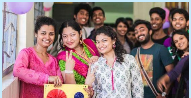
BMS Faculty with students on teachers day