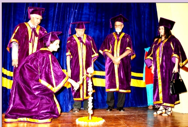
Lighting of the lamp