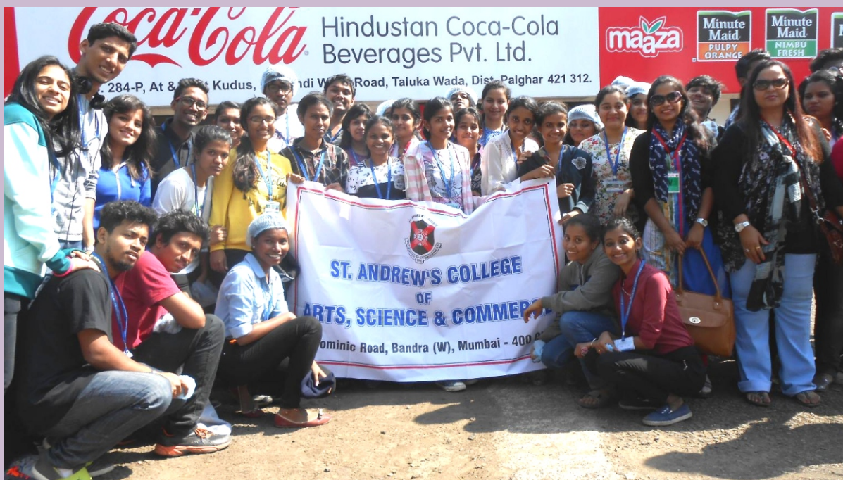
Commerce Dept. Field Trip to Coca Cola Factory, Wada