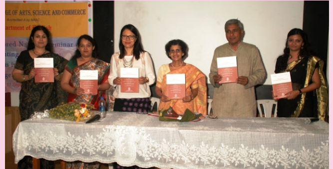
Release of 'Ruminations', the research journal of the Department of English