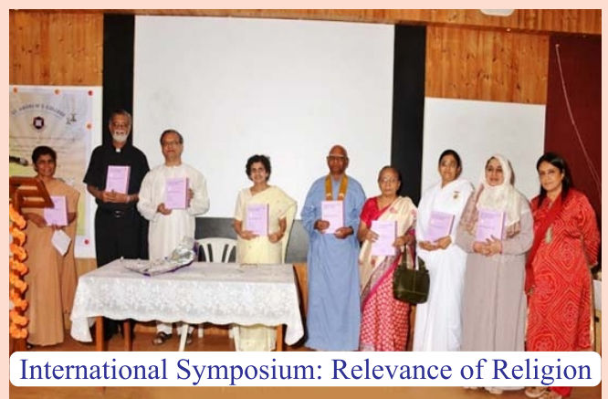
International Symposium: Relevance of Religion