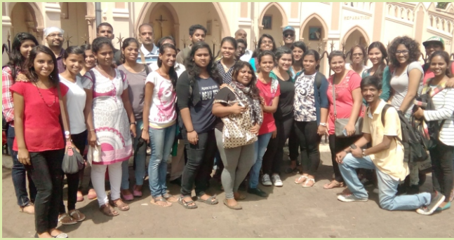
Economic – History Depts. - Bandra Heritage Walk