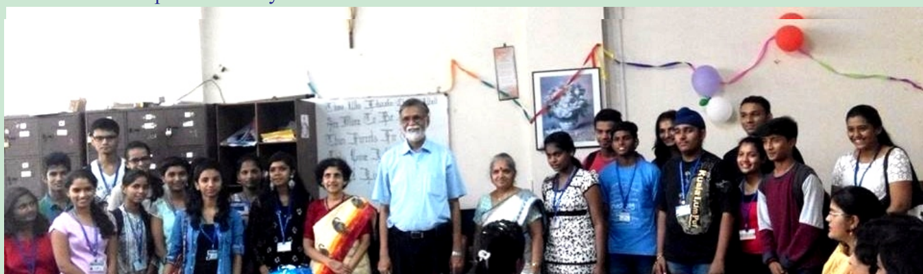
Student Council Members