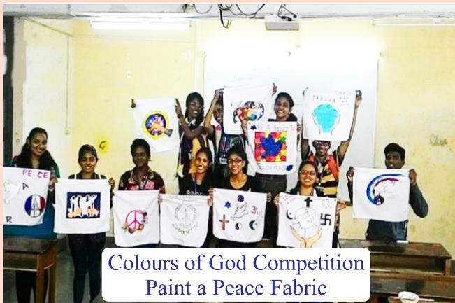
Colours of God Competition Paint a Peace Fabric