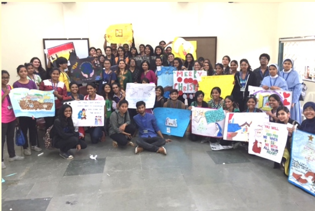
Poster making competition