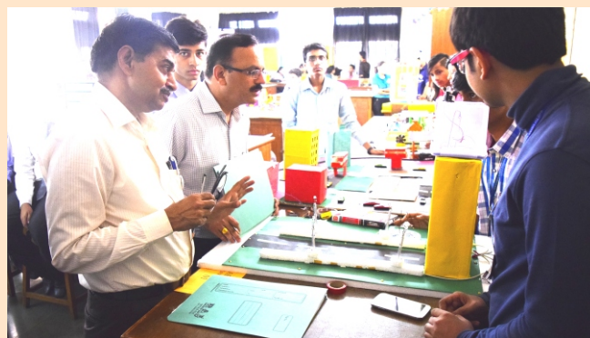
Judging the working models on display