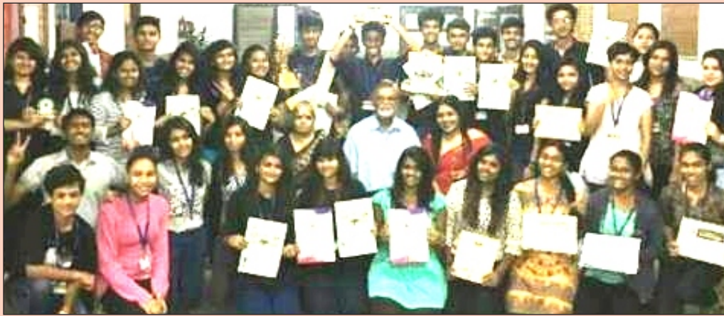
Andrean Team Wins-Best College Trophy