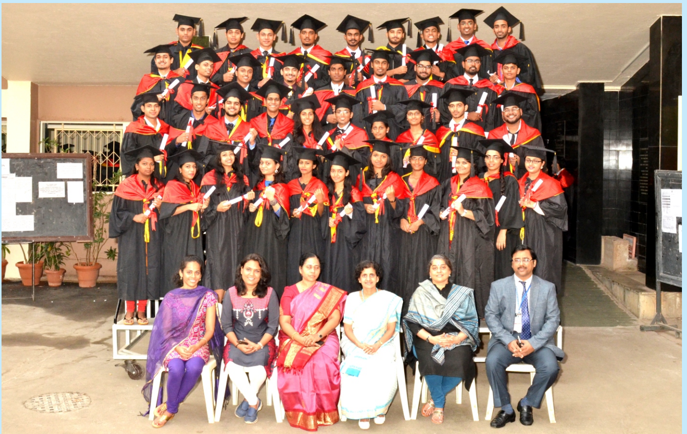
T. Y. B. Sc. (I. T.)