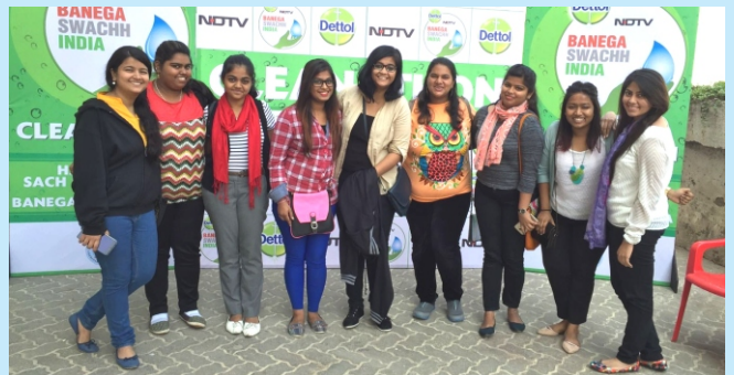
Participation in Swach Bharat Campaign- A P&G initiative.