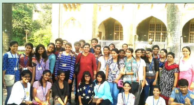
Visit to Chatrapati Shivaji Maharaj Vastu Sangralaya