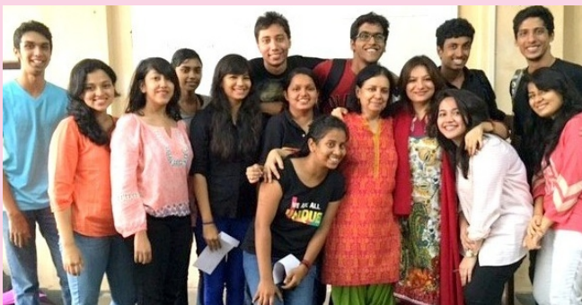
Faculty members with participants of Andean Psychology Quiz competition