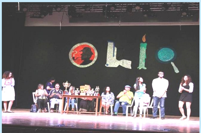
Participants in action