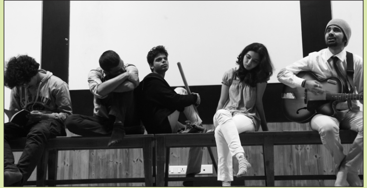
Arcadia – The Lost Land: Play Performance