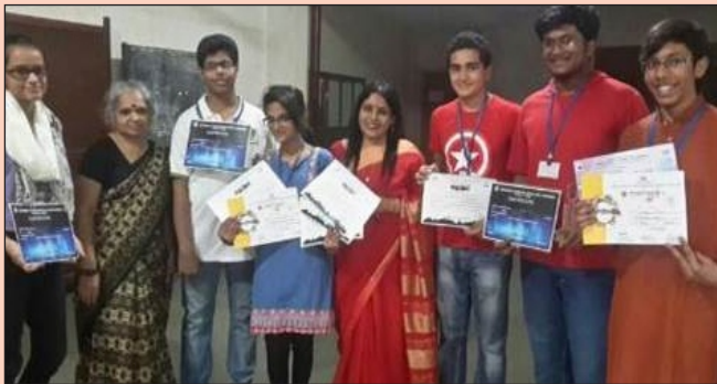
Best College Trophy-Emorzeal