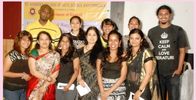
English Department faculty with the organizing committee