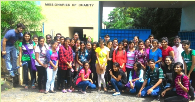
Missionaries of Charity – Goregaon