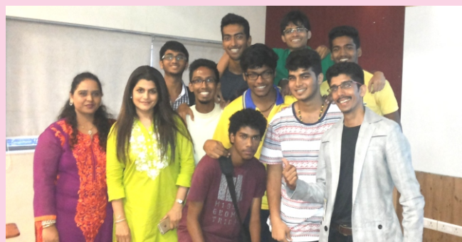
Winning Team of Shoot an Ad Competition