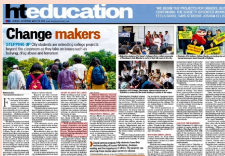
Guided project picked up by the Press (Hindustan Times)