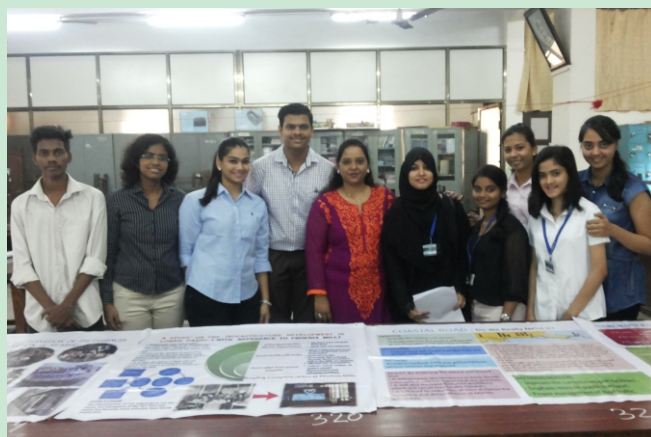
Students presenting research papers at the district level