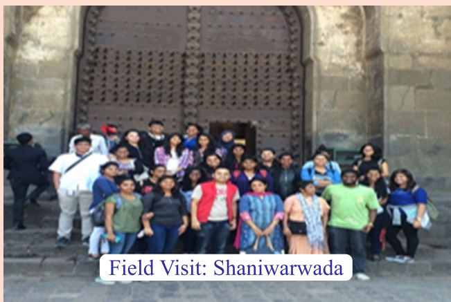
Field Visit: Shaniwarwada