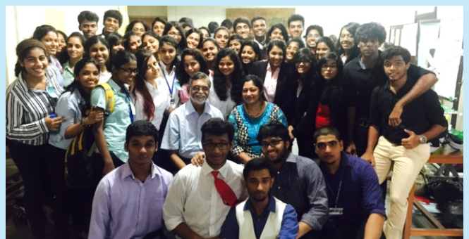
Back in Time- Management projects