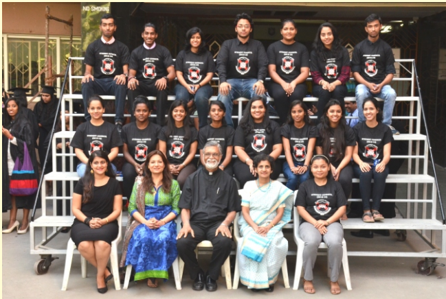
Students' Council Team