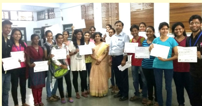
Sweden Quiz Competition Participants