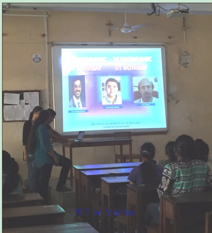
PPT on Mumbai