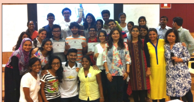
Winner - St. Andrew's College