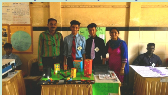
Winning Team at H –Ward Science Exhibition organized by Education Department