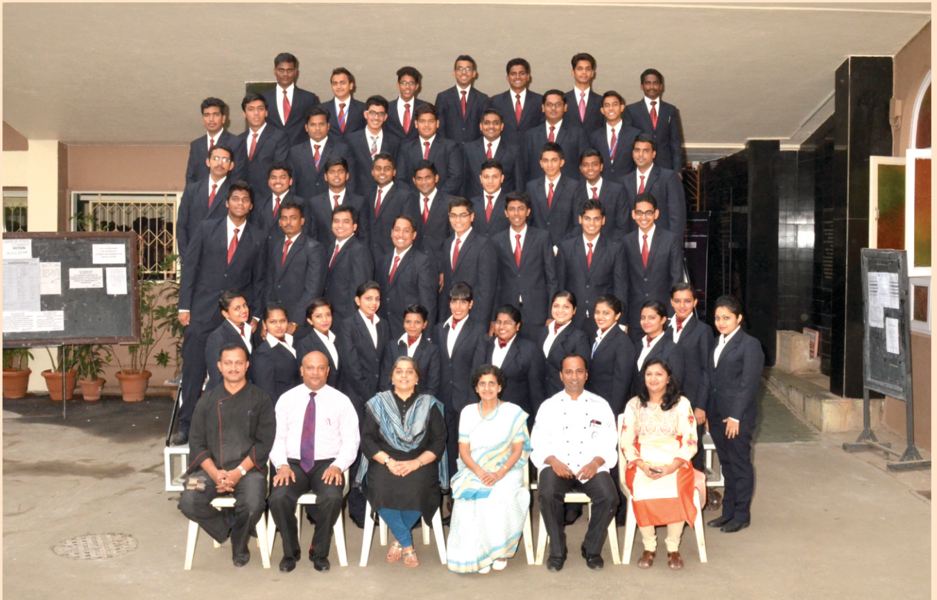
T. Y. B. Sc. (Hospitality)