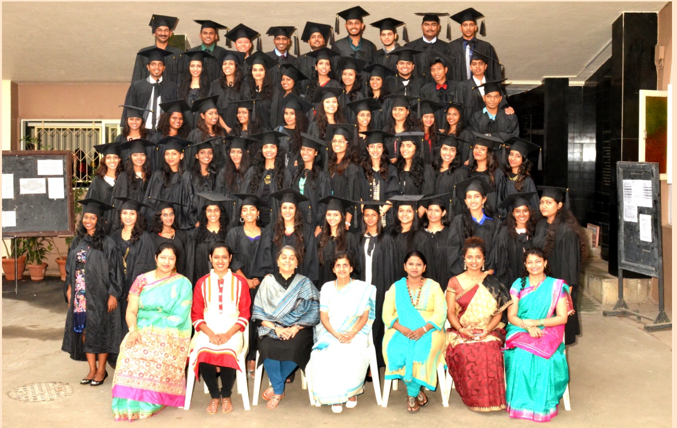
T. Y. B. Com. (B & I)