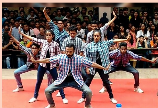
XoR Dance Group