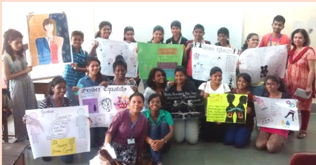
Poster competition on "Gender Equality"