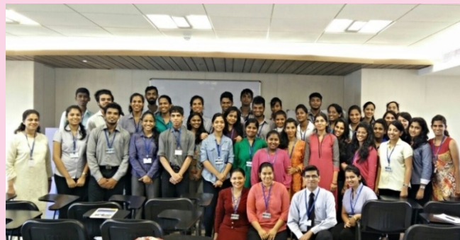
BSE Visit - Seminar on Financial Planning by International College of Financial Planning