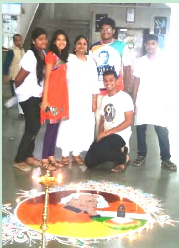
Honouring late APJ Kalam on Independence Day