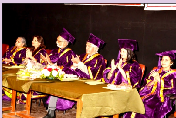
Dignitaries on stage