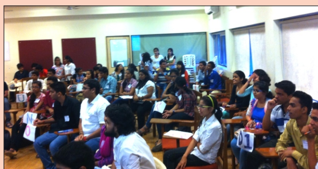
Participants of Mind Maze 2015-16