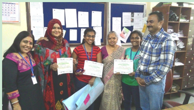
Winners at - “Science Rendezvous”- Organized by D.G.Ruparel College.