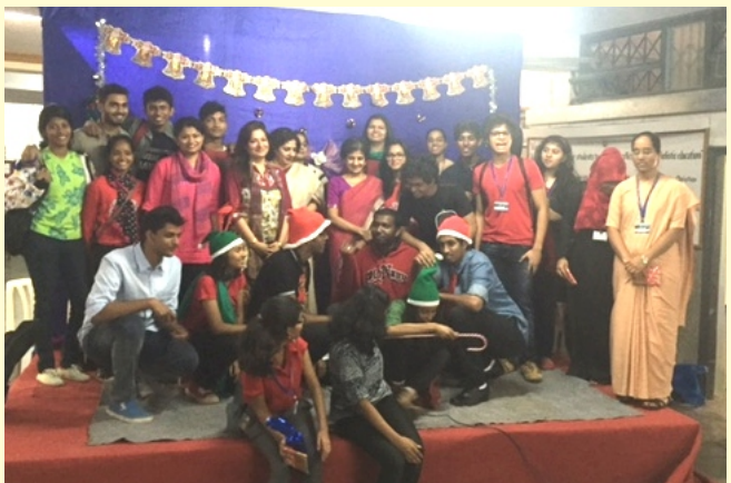
Carol singing competition