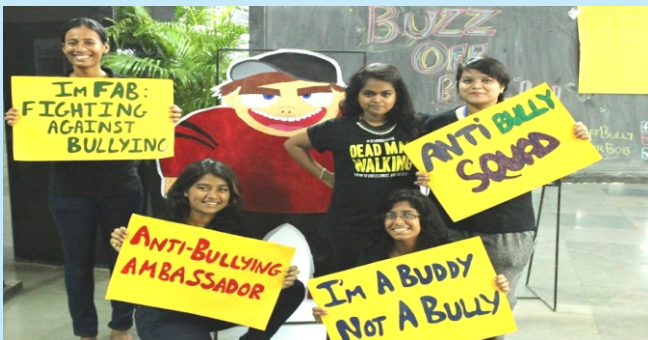
Social Awareness Campaign – Buzz of Bully