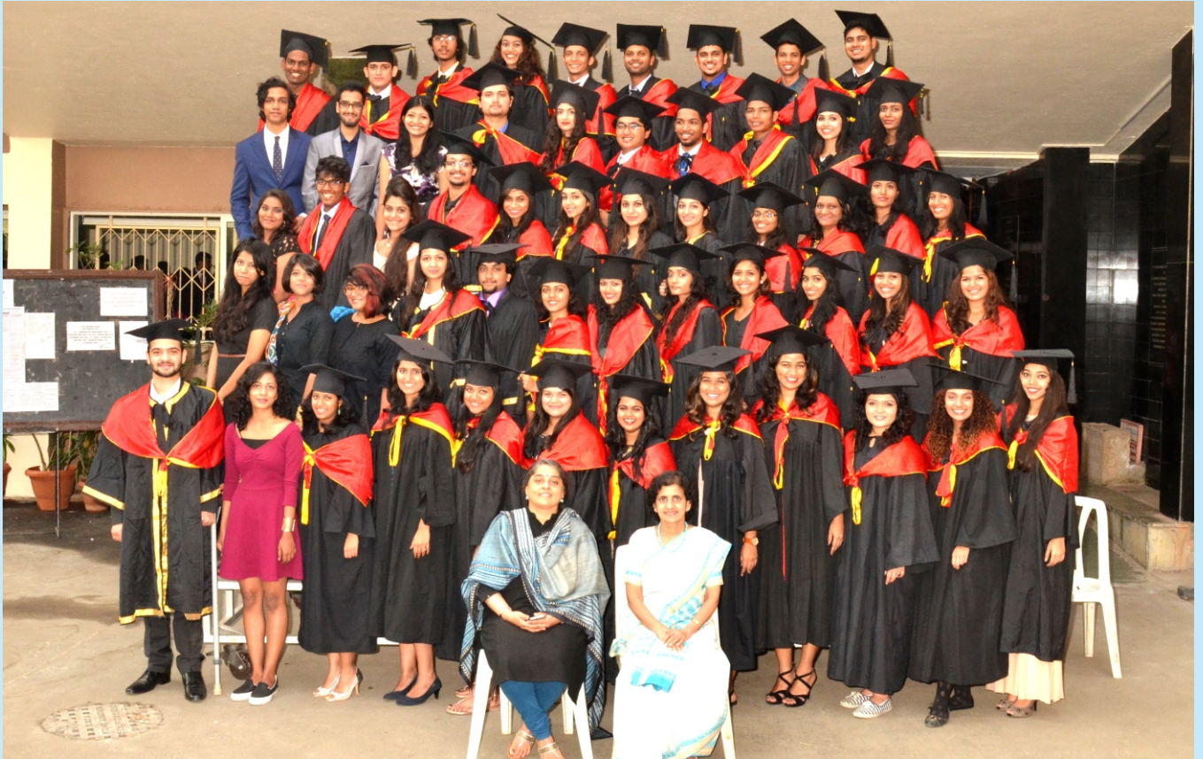
T. Y. B. M. M.