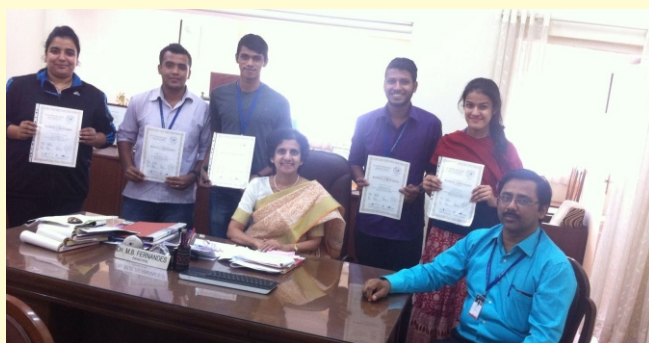
Delegates at the Indian Student Parliament with Certificates