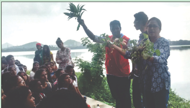
Eco-tour to Powai Lake