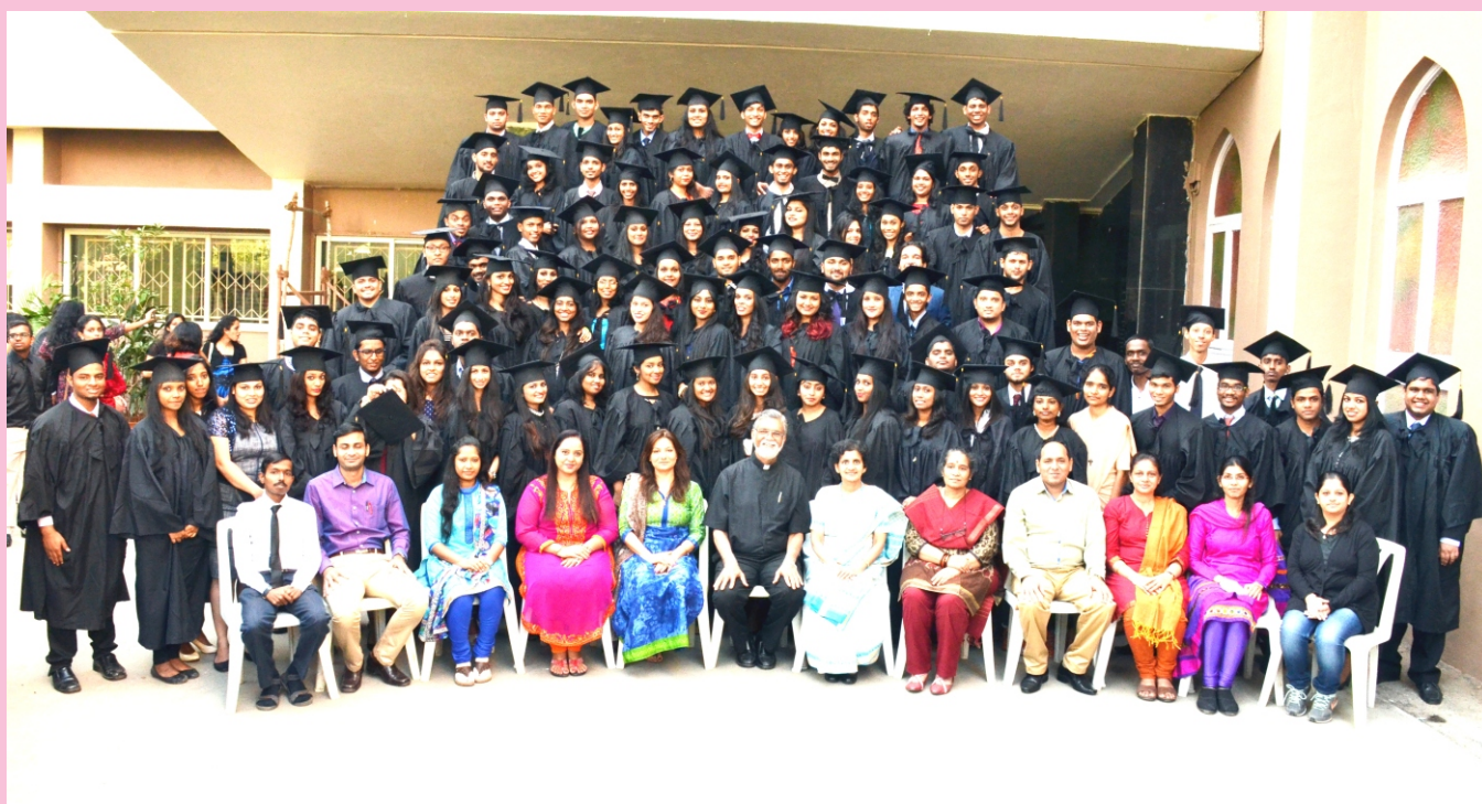
T. Y. B. Com. Div. - C