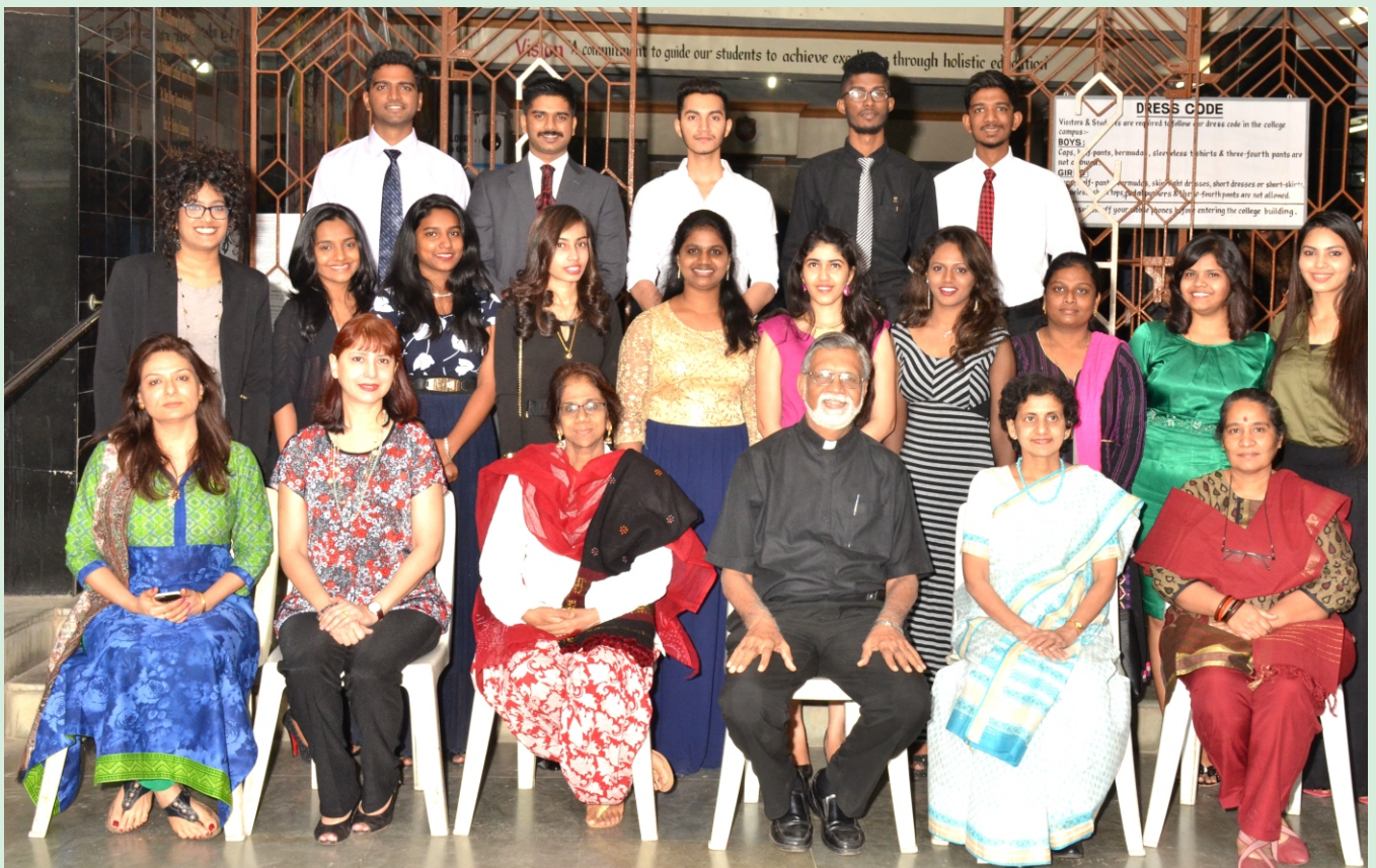
T. Y. B. A. Economics