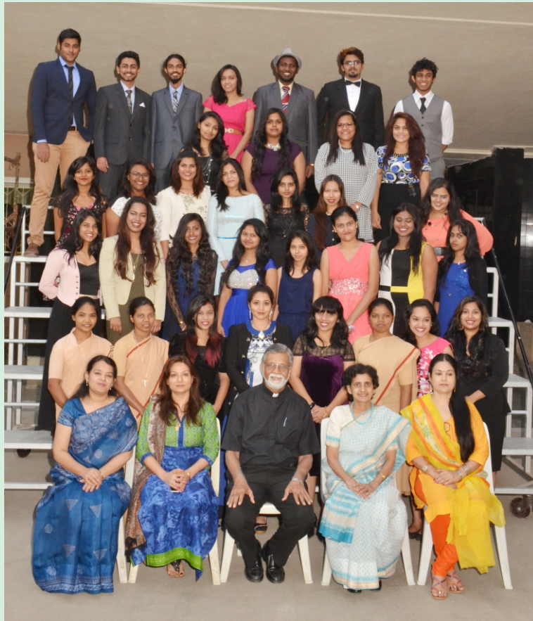
T. Y. B. A. English