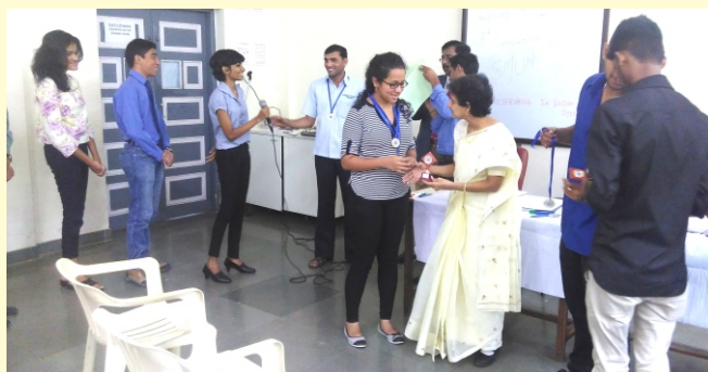
Felicitation of SMUN Members