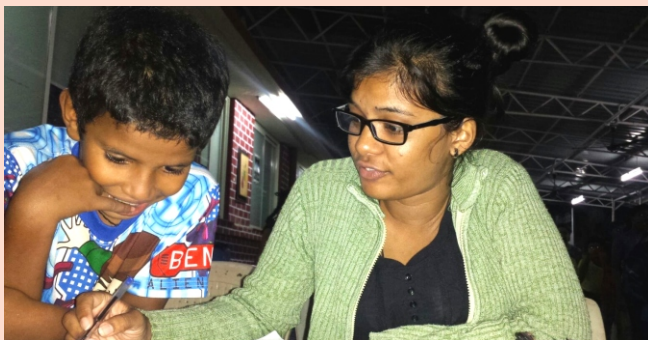
Teaching at the Andrean Social Service Center