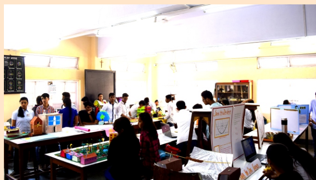
Techno-Science Galaxy in progress