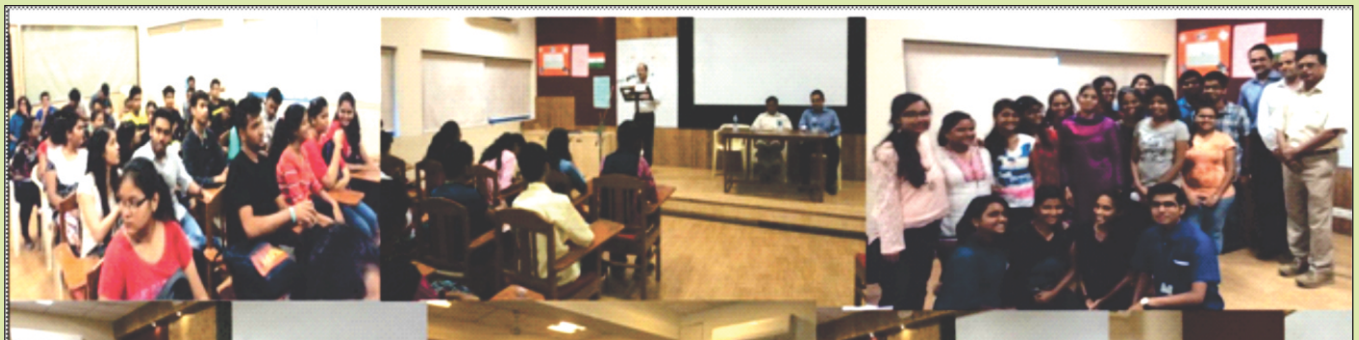
Session On Kalaam Ko Salaam