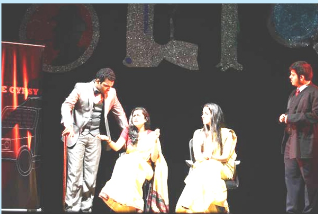
Intense action on stage