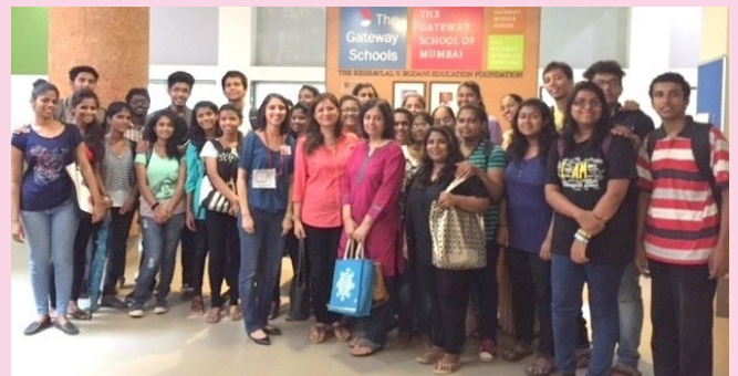
Educational visit to Gateway School, Mumbai-School for children with special needs.