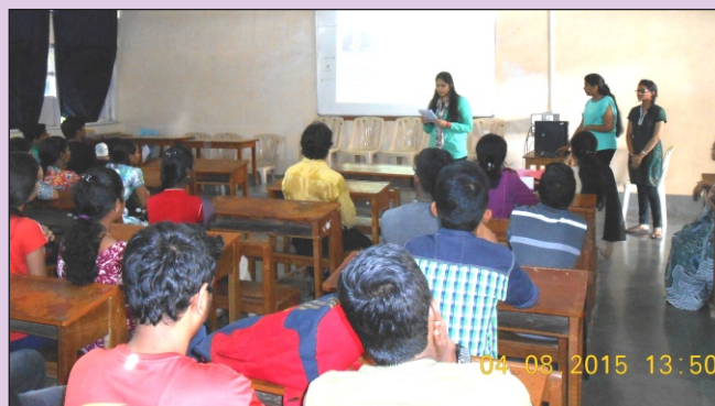
Department of Physics