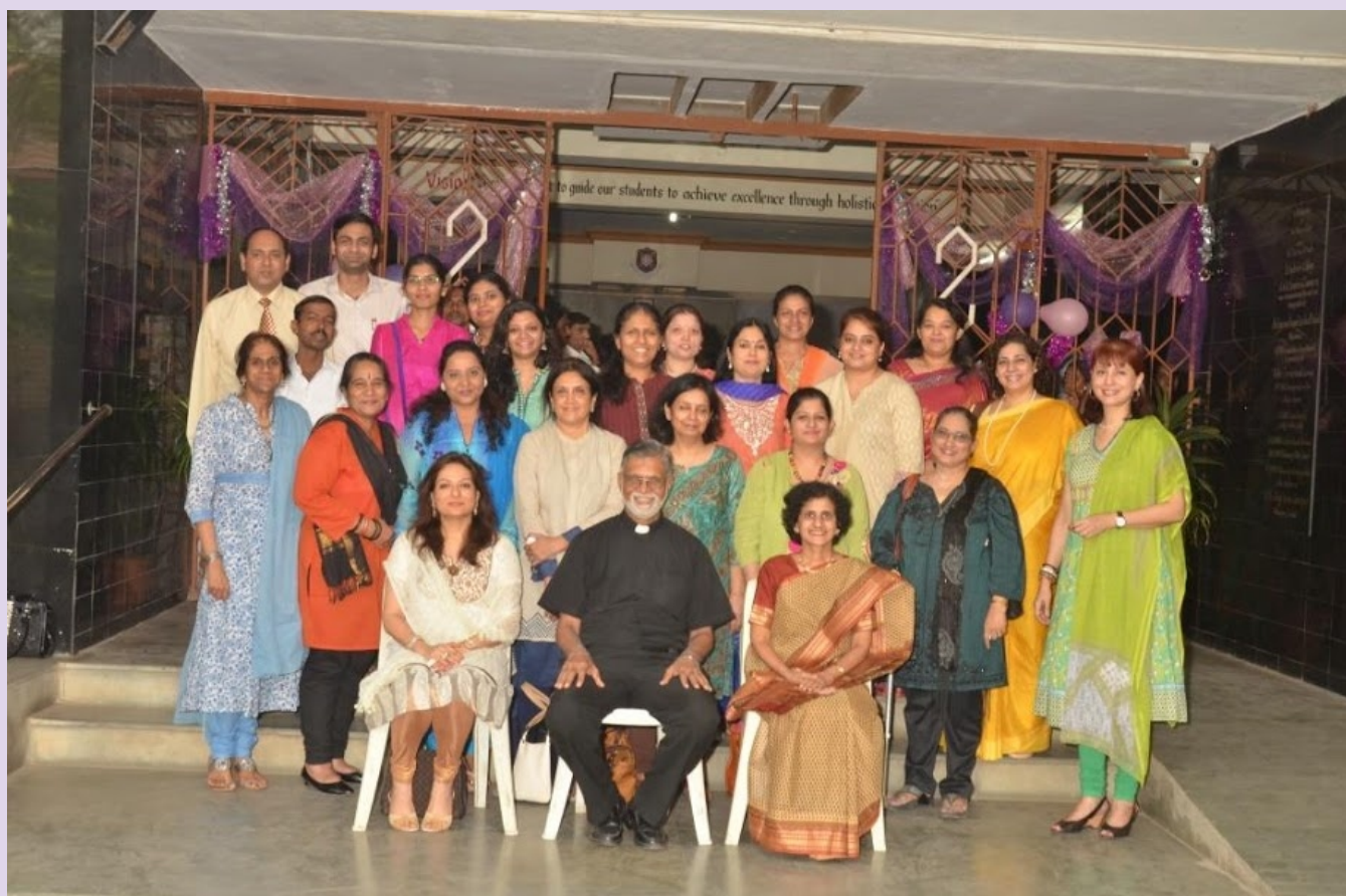
Teaching Staff - Degree College